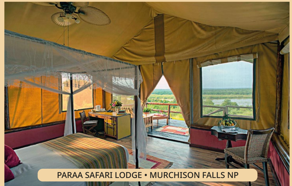
PARAA SAFARI LODGE • MURCHISON FALLS NP