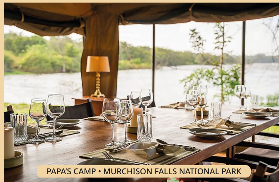
PAPA'S CAMP • MURCHISON FALLS NATIONAL PARK