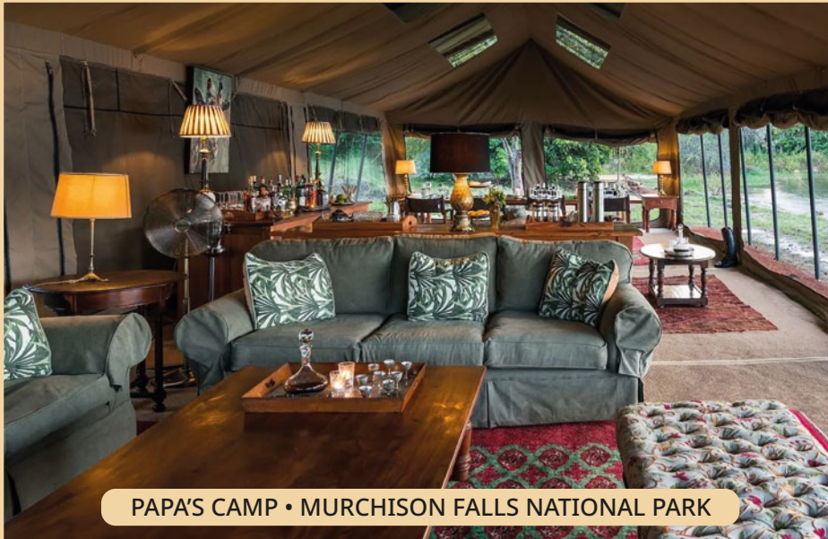
PAPA'S CAMP • MURCHISON FALLS NATIONAL PARK