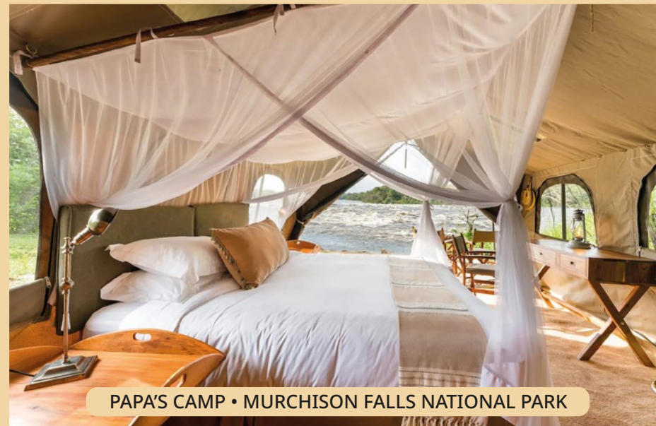
PAPA'S CAMP • MURCHISON FALLS NATIONAL PARK