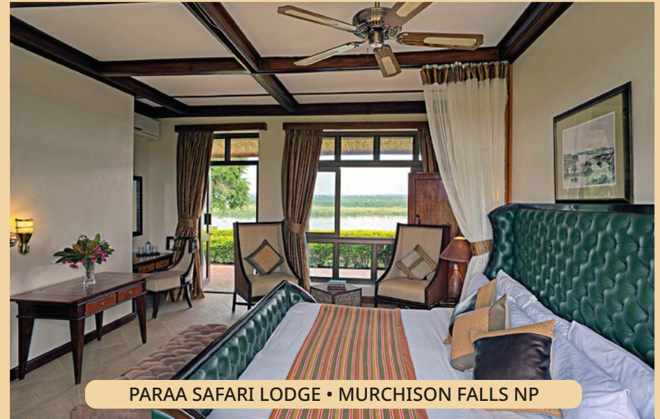
PARAA SAFARI LODGE • MURCHISON FALLS NP