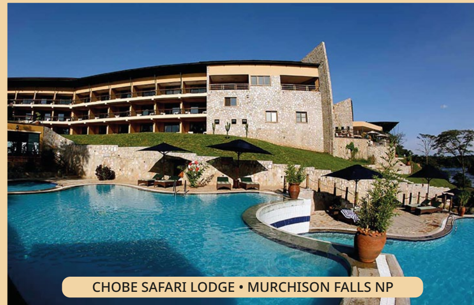
CHOBESAFARI LODGE • MURCHISON FALLS NP