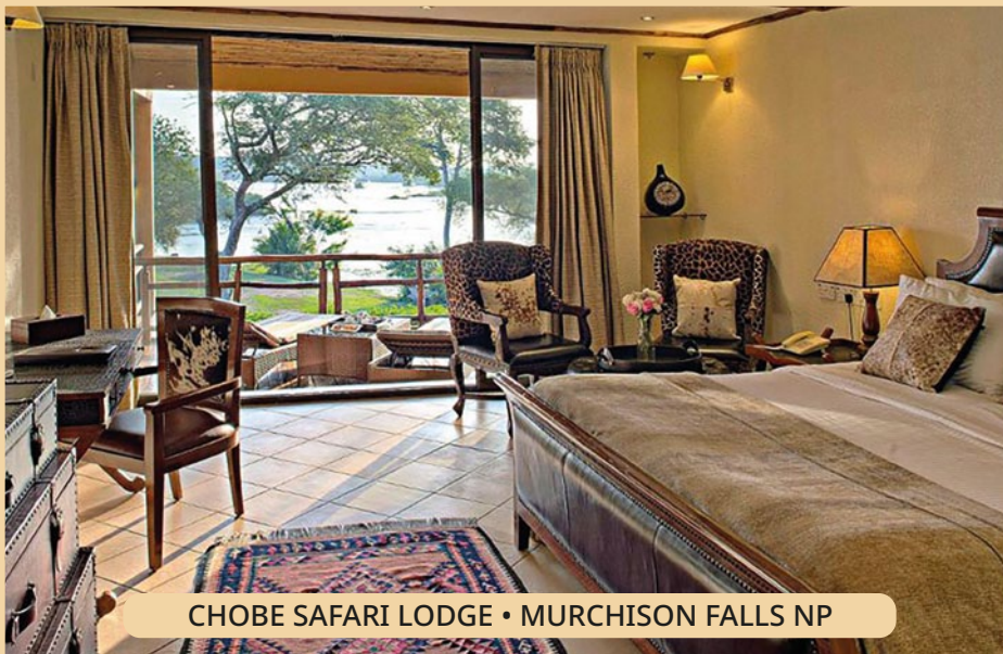
CHOBESAFARI LODGE • MURCHISON FALLS NP