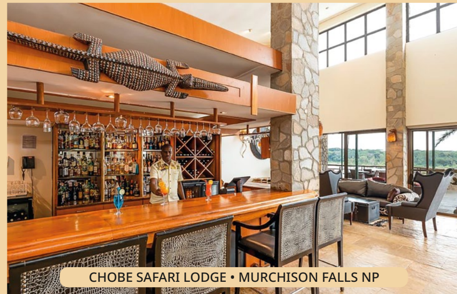
CHOBESAFARI LODGE • MURCHISON FALLS NP