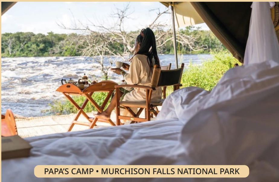
PAPA'S CAMP • MURCHISON FALLS NATIONAL PARK