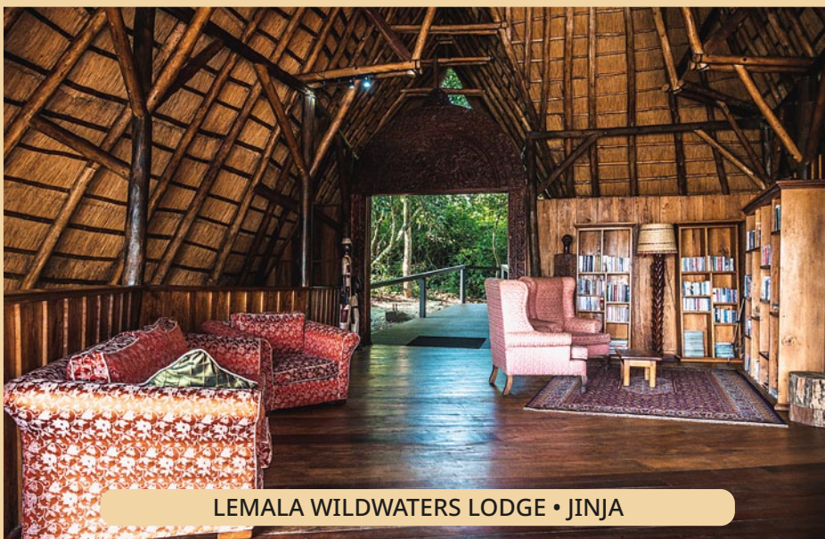
LEMALA WILDWATERS LODGE • JINJA