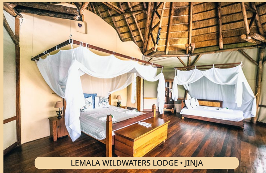
LEMALA WILDWATERS LODGE • JINJA