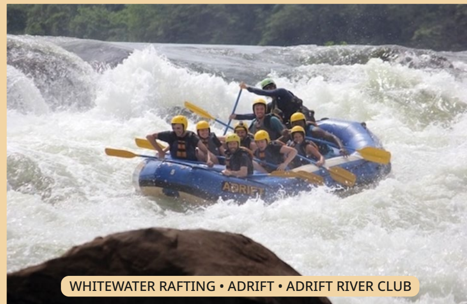
WHITEWATER RAFTING • ADRIFT • ADRIFT RIVER CLUB