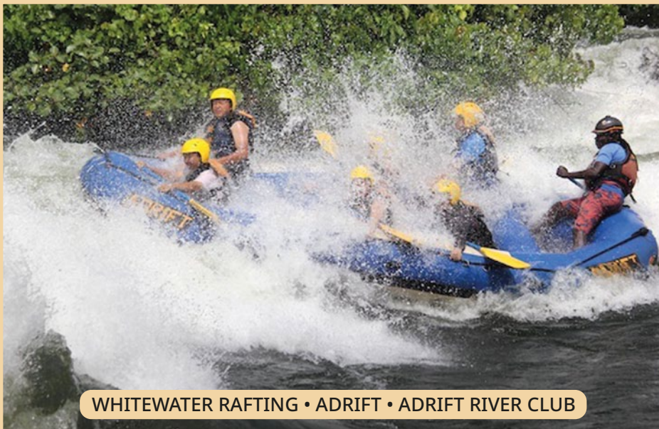
WHITEWATER RAFTING • ADRIFT • ADRIFT RIVER CLUB