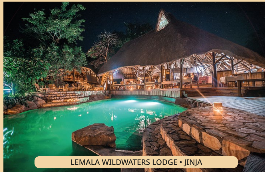
LEMALA WILDWATERS LODGE • JINJA