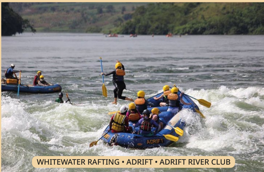
WHITEWATER RAFTING • ADRIFT • ADRIFT RIVER CLUB