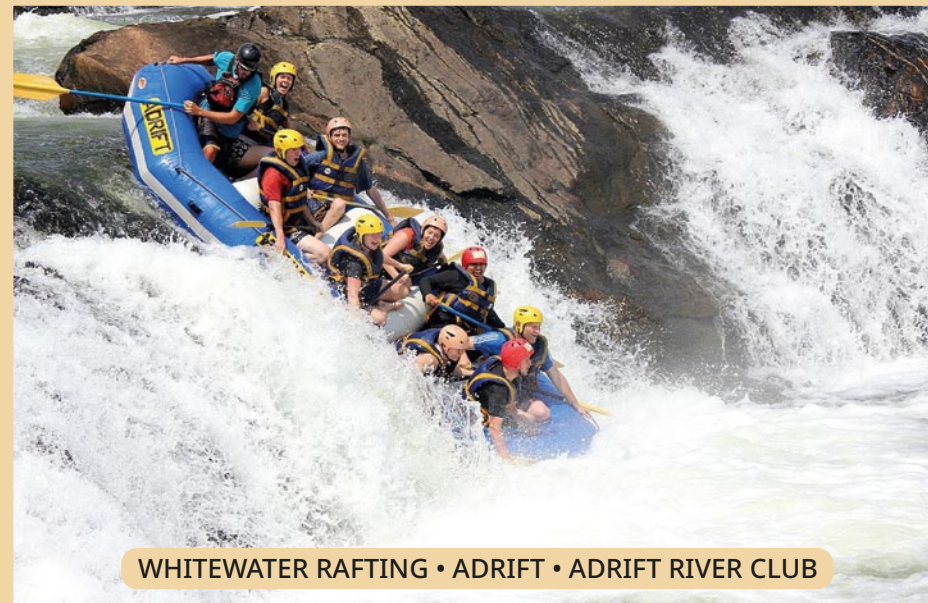
WHITEWATER RAFTING • ADRIFT • ADRIFT RIVER CLUB