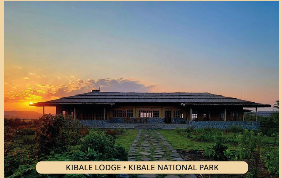
KIBALE LODGE • KIBALE NATIONAL PARK