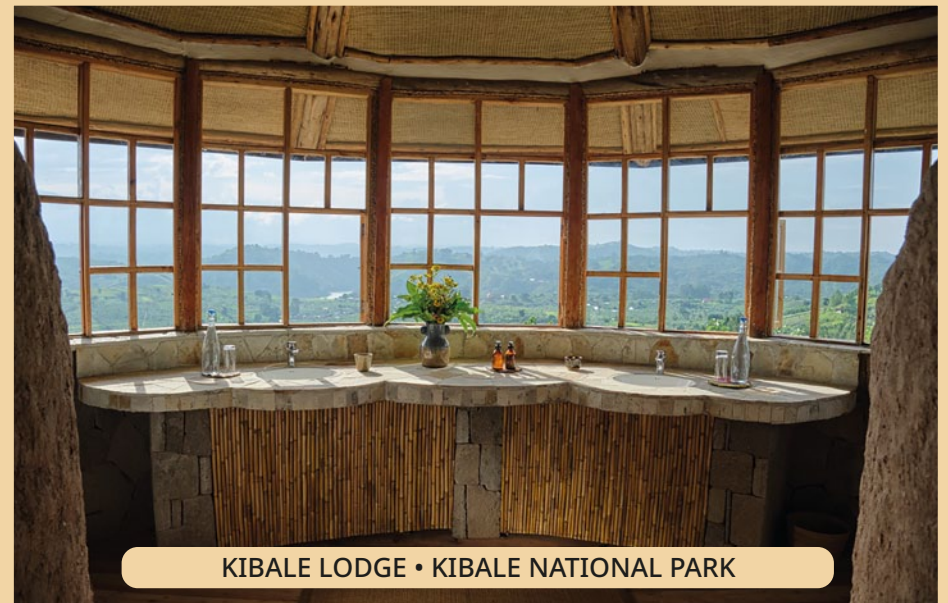
KIBALE LODGE • KIBALE NATIONAL PARK