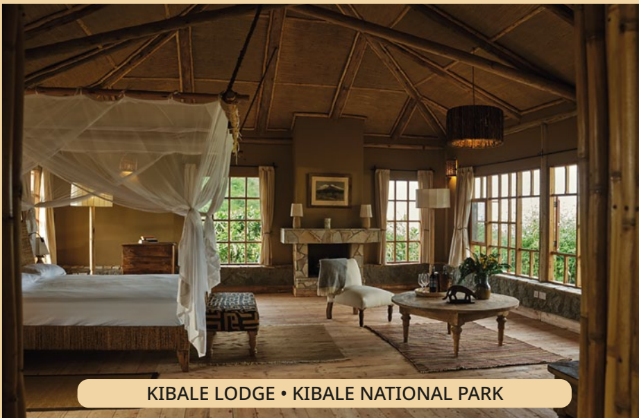
KIBALE LODGE • KIBALE NATIONAL PARK