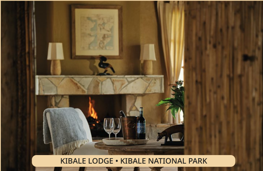
KIBALE LODGE • KIBALE NATIONAL PARK