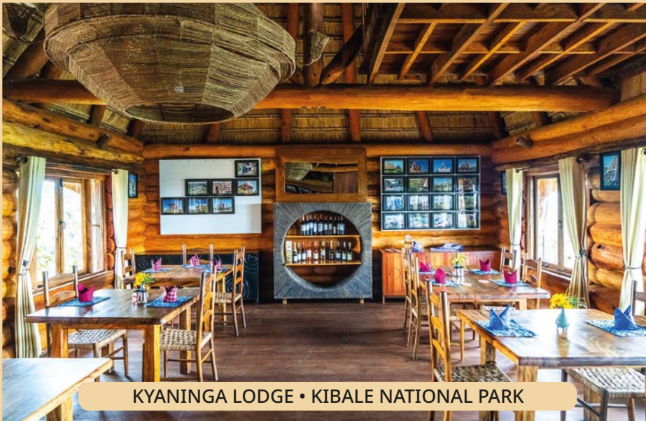
KYANINGA LODGE • KIBALE NATIONAL PARK