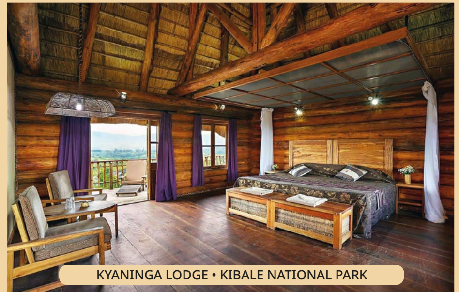
KYANINGA LODGE • KIBALE NATIONAL PARK