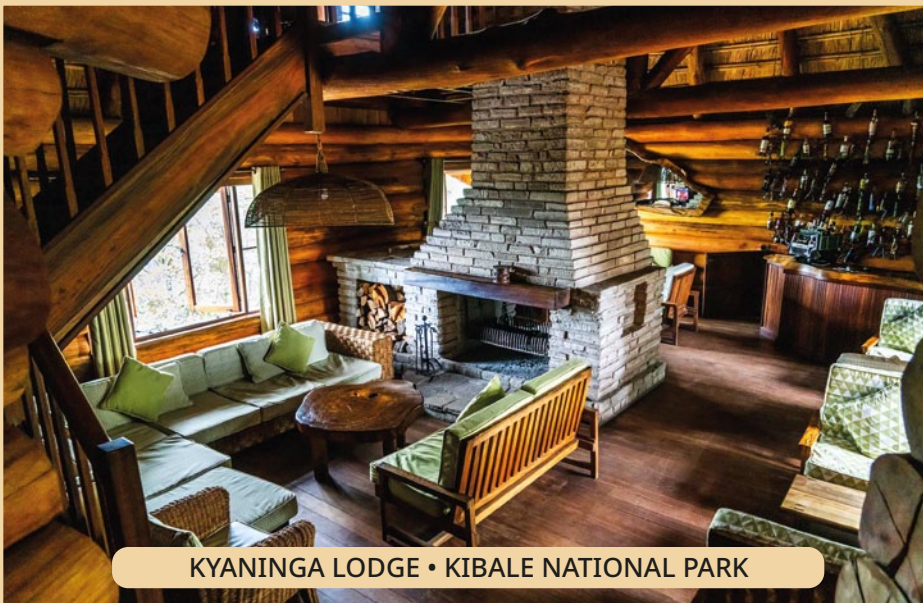
KYANINGA LODGE • KIBALE NATIONAL PARK