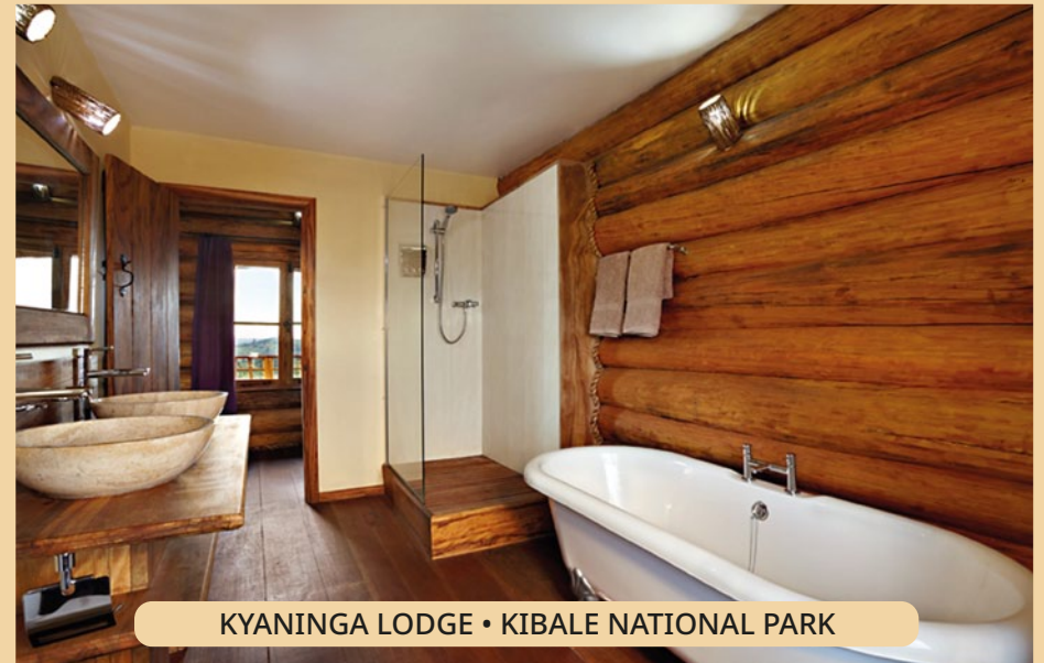
KYANINGA LODGE • KIBALE NATIONAL PARK