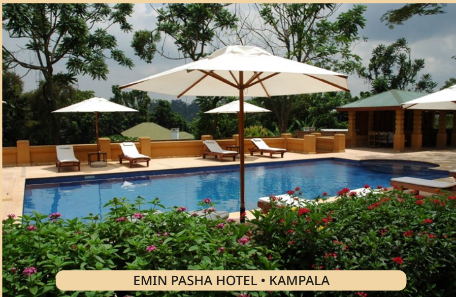
EMIN PASHA HOTEL • KAMPALA