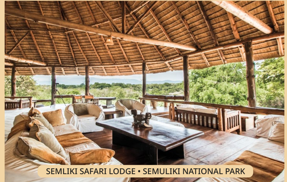
SEMLIKI SAFARI LODGE • SEMULIKI NATIONAL PARK