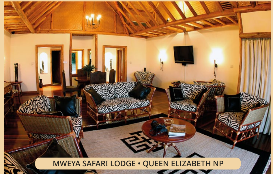
MWEYA SAFARI LODGE • QUEEN ELIZABETH NP