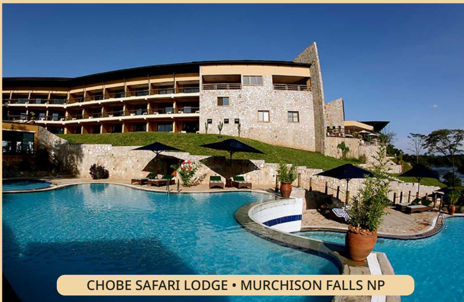
CHOBE SAFARI LODGE • MURCHISON FALLS NP