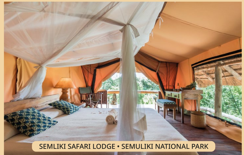
SEMLIKI SAFARI LODGE • SEMULIKI NATIONAL PARK