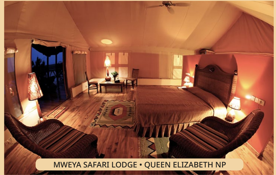
MWEYA SAFARI LODGE • QUEEN ELIZABETH NP