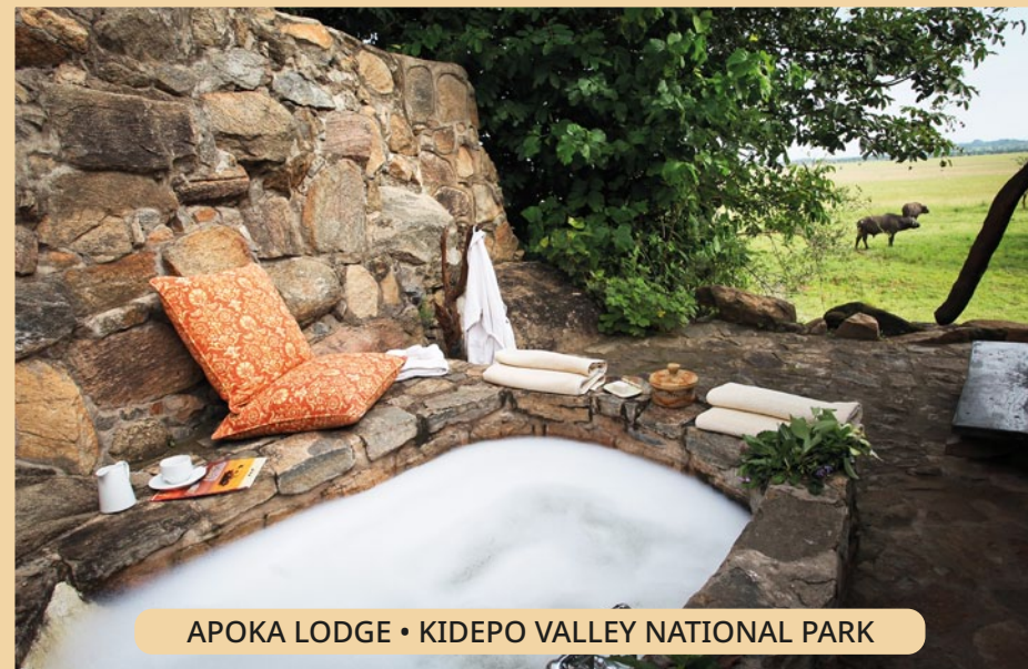
APOKA LODGE • KIDEPO VALLEY NATIONAL PARK