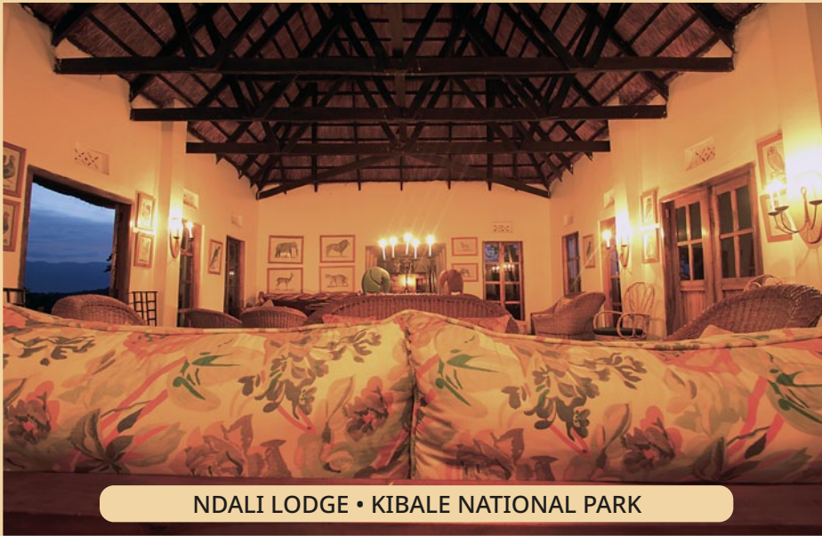
NDALI LODGE • KIBALE NATIONAL PARK