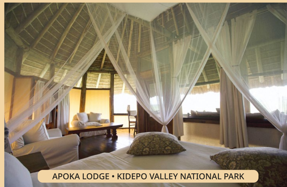
APOKA LODGE • KIDEPO VALLEY NATIONAL PARK