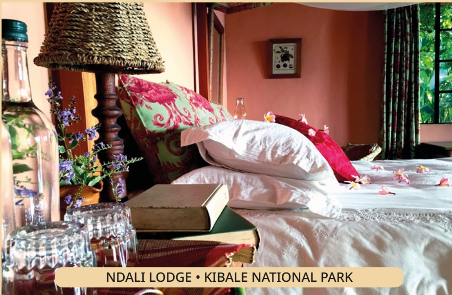
NDALI LODGE • KIBALE NATIONAL PARK