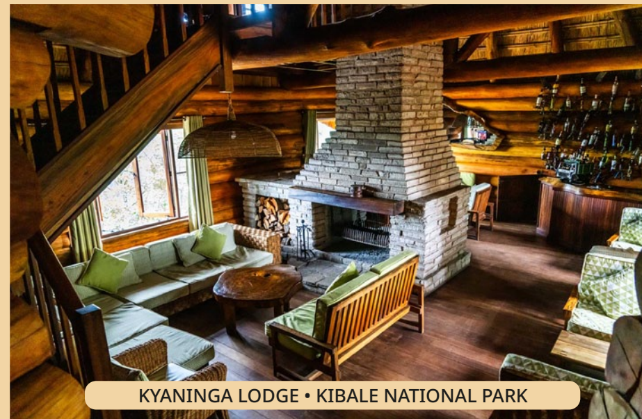
KYANINGA LODGE • KIBALE NATIONAL PARK