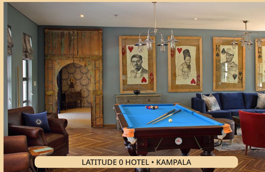
LATITUDE 0 HOTEL • KAMPALA