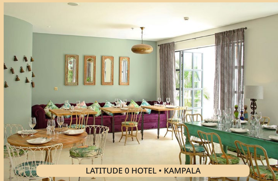
LATITUDE 0 HOTEL • KAMPALA