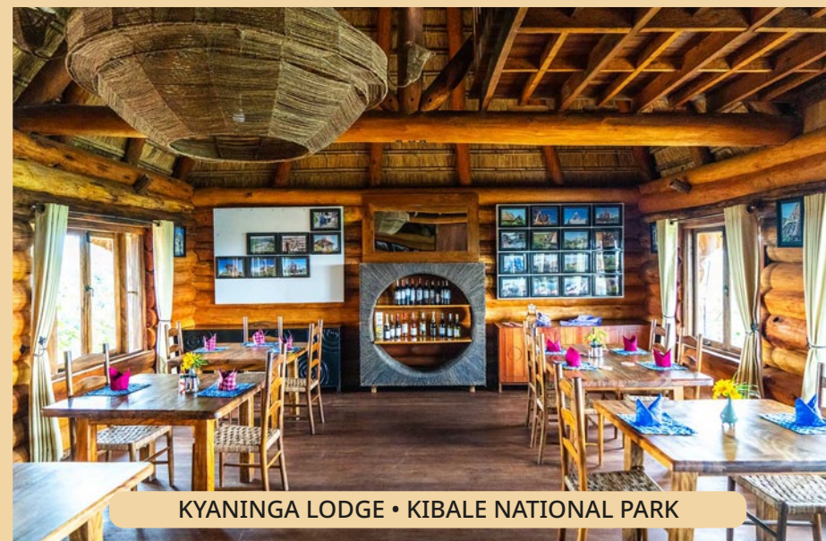
KYANINGA LODGE • KIBALE NATIONAL PARK