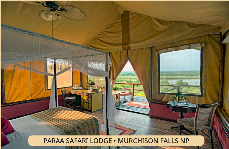
PARAA SAFARI LODGE • MURCHISON FALLS NP