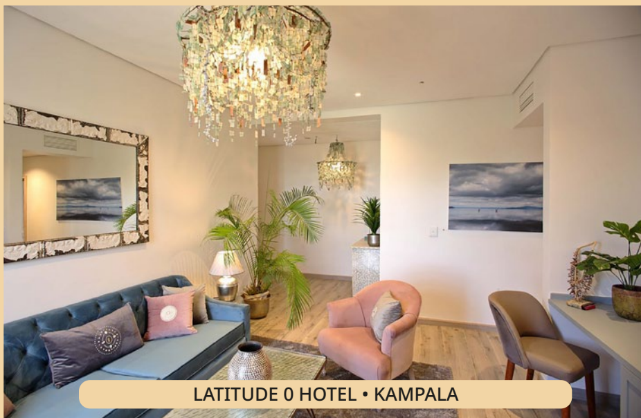
LATITUDE 0 HOTEL • KAMPALA