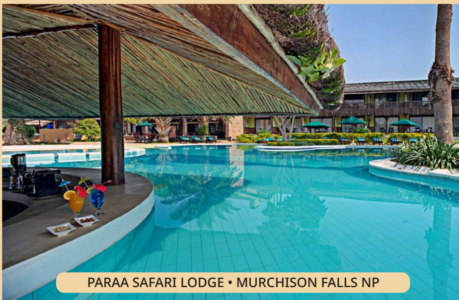
PARAA SAFARI LODGE • MURCHISON FALLS NP