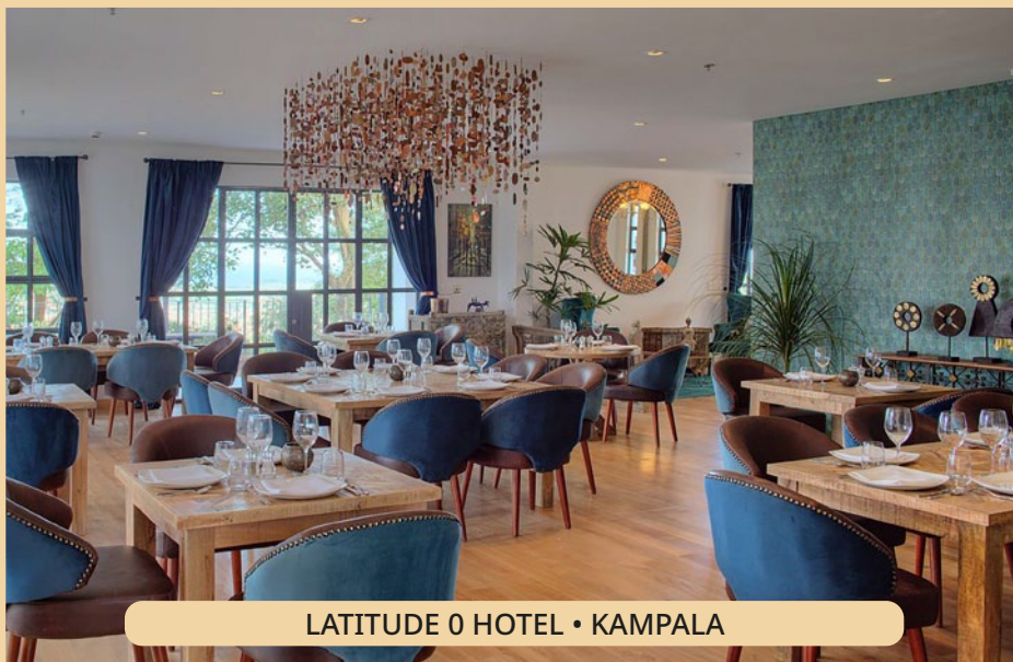
LATITUDE 0 HOTEL • KAMPALA