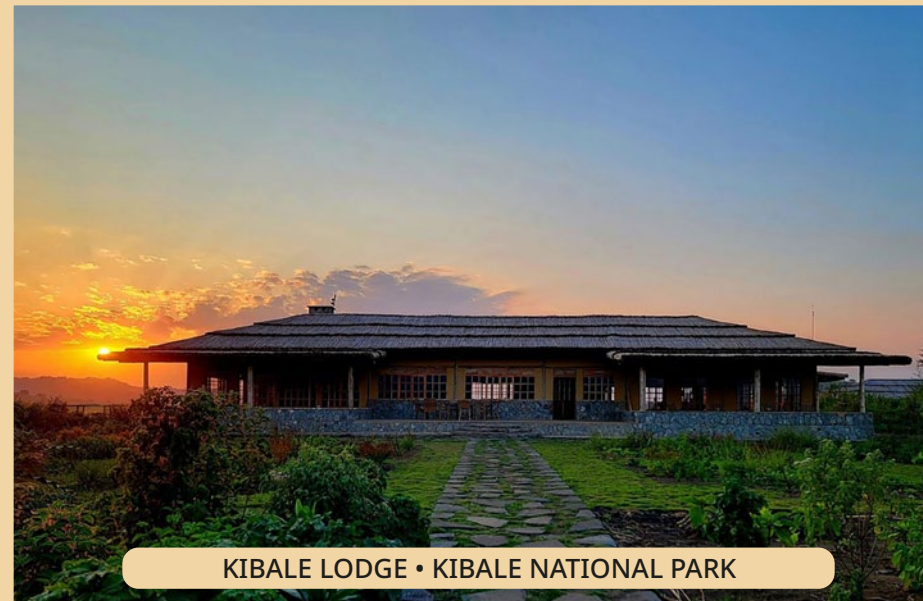
KIBALE LODGE • KIBALE NATIONAL PARK