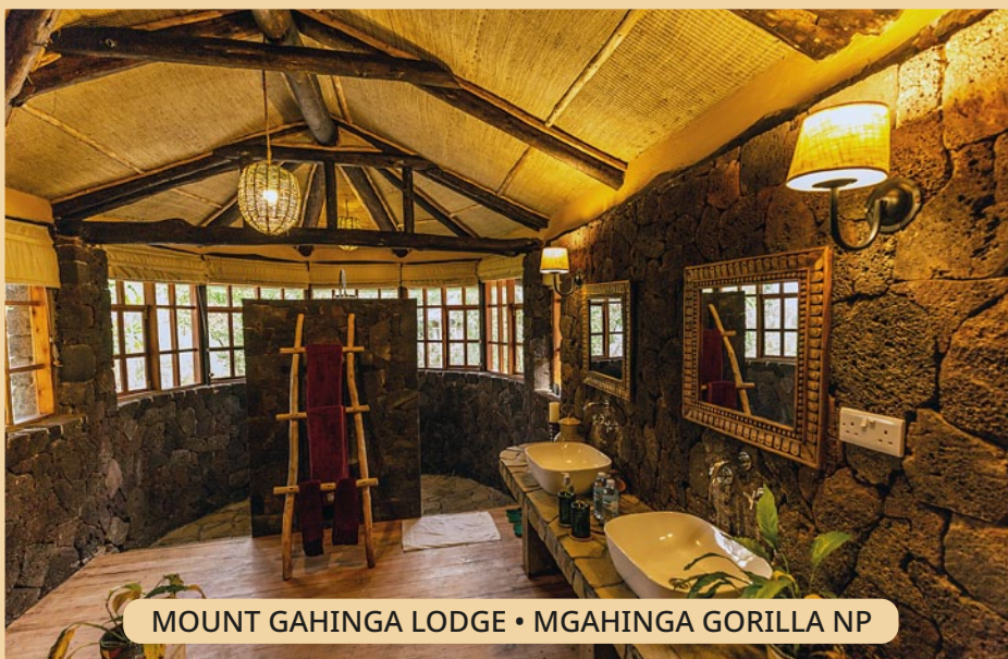
MOUNT GAHINGA LODGE • MGAHINGA GORILLA NP