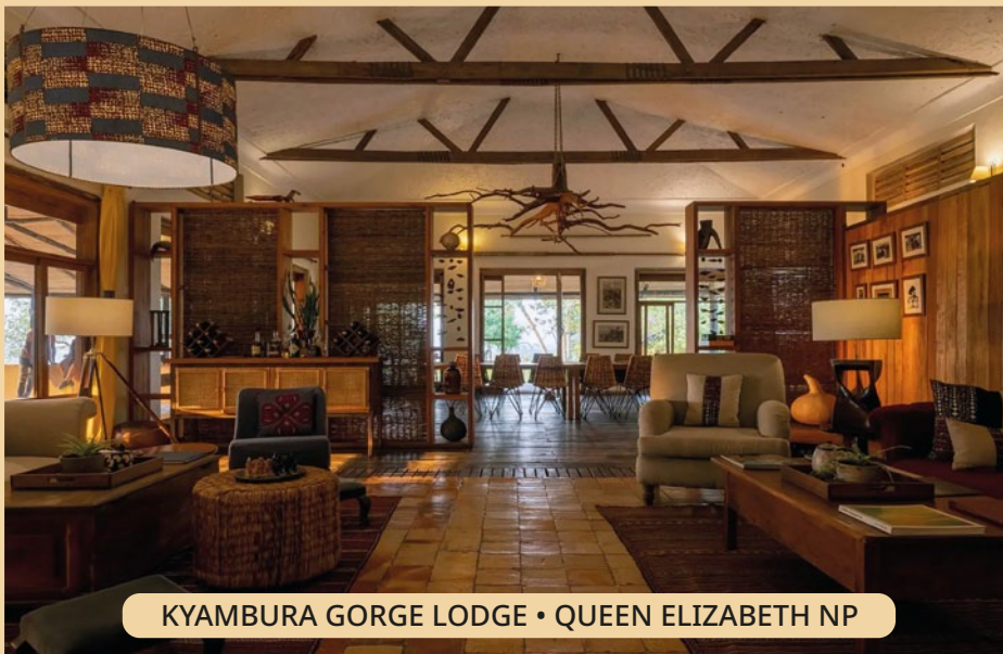
KYAMBURA GORGE LODGE • QUEEN ELIZABETH NP