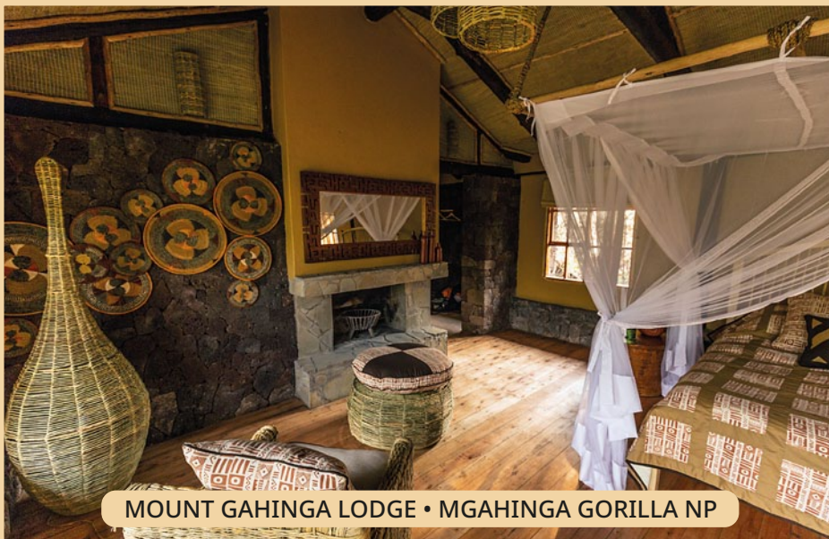
MOUNT GAHINGA LODGE • MGAHINGA GORILLA NP