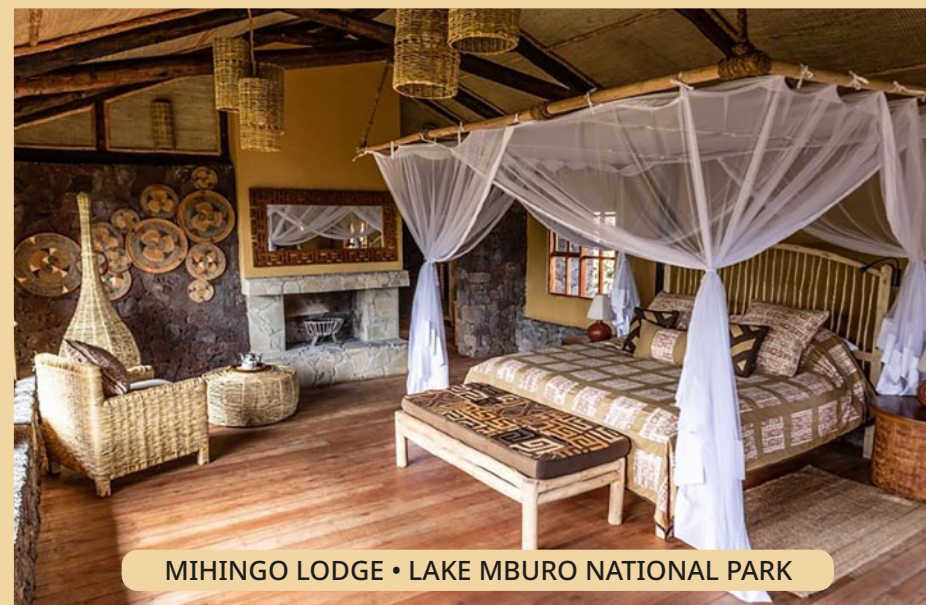
MIHINGO LODGE • LAKE MBURO NATIONAL PARK