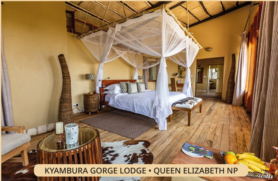
KYAMBURA GORGE LODGE • QUEEN ELIZABETH NP