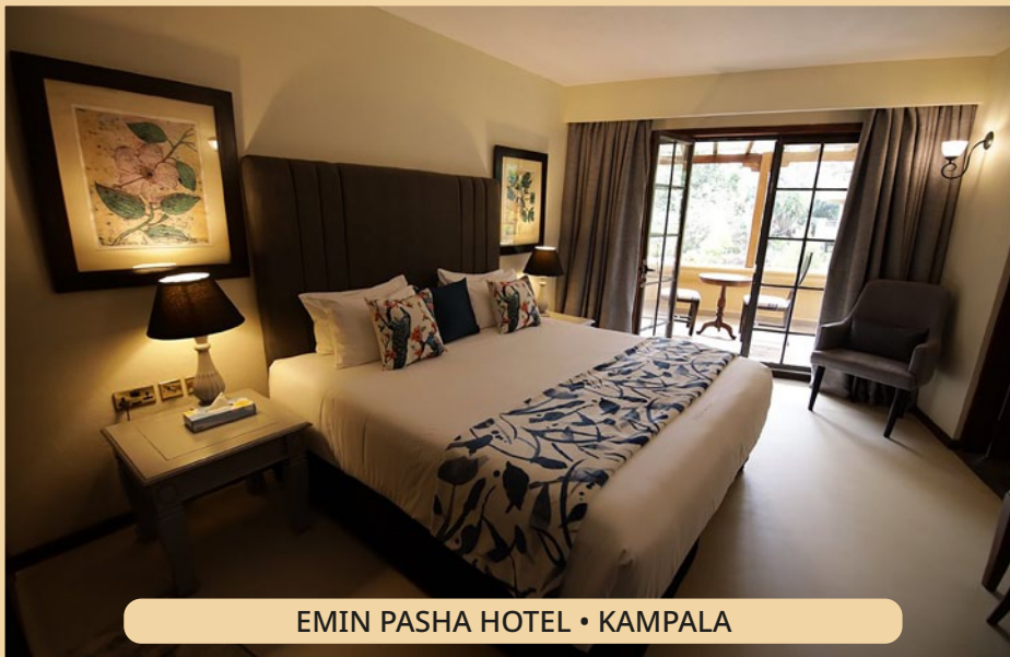
EMIN PASHA HOTEL • KAMPALA