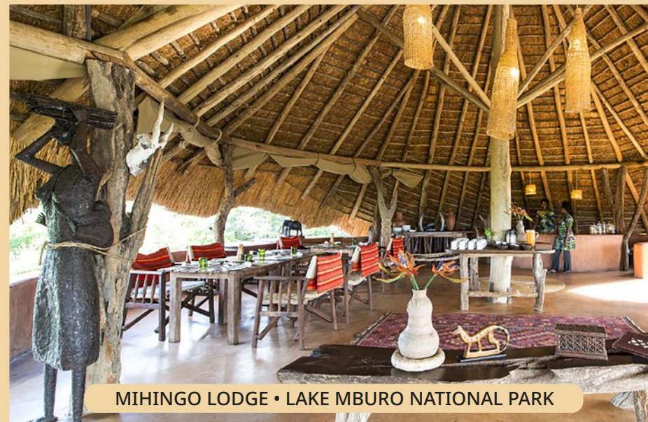
MIHINGO LODGE • LAKE MBURO NATIONAL PARK