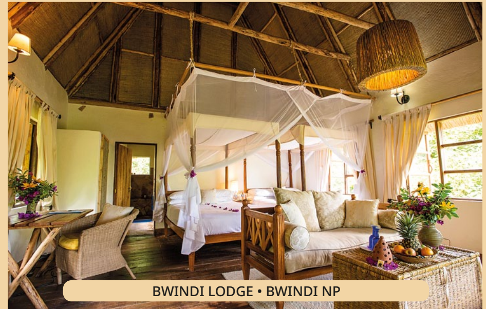
BWINDI LODGE • BWINDI NP