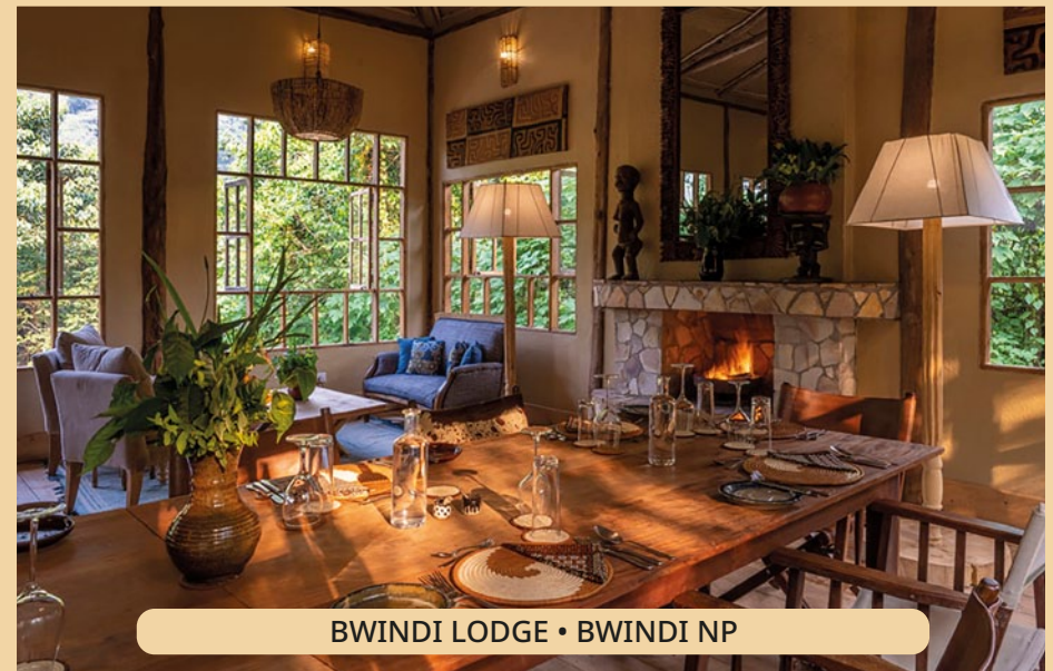
BWINDI LODGE • BWINDI NP