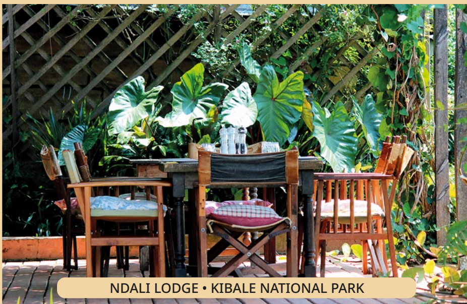
NDALI LODGE • KIBALE NATIONAL PARK