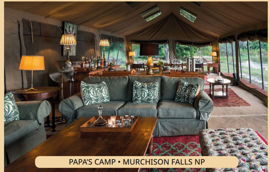
PAPA'S CAMP • MURCHISON FALLS NP