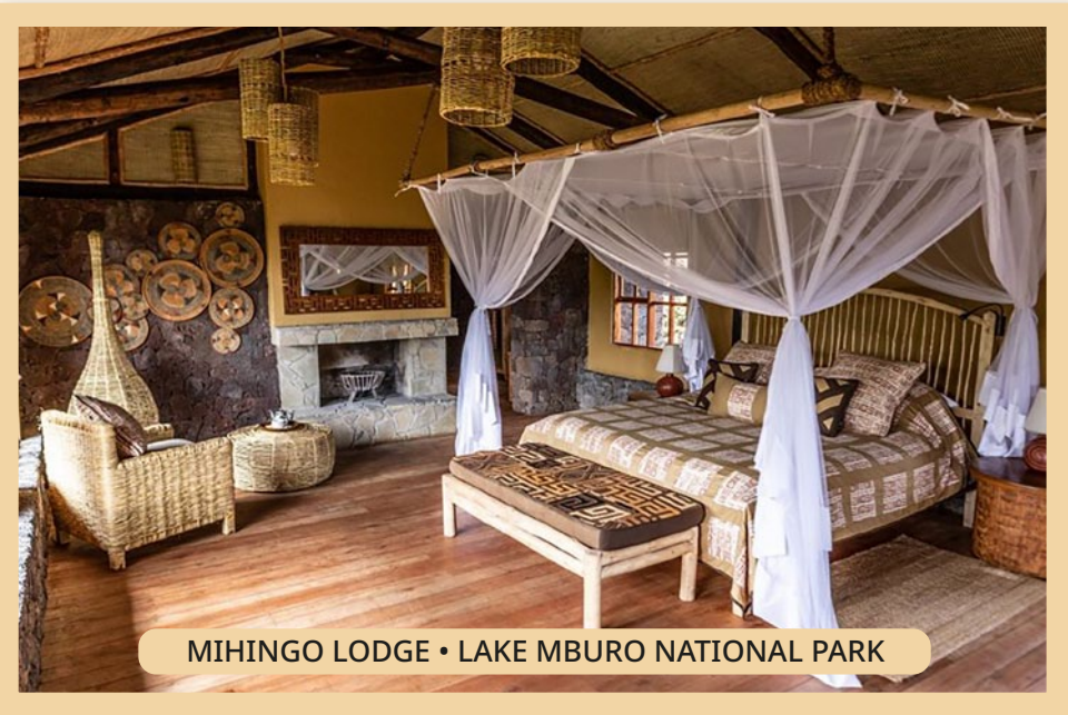
MIHINGO LODGE • LAKE MBURO NATIONAL PARK