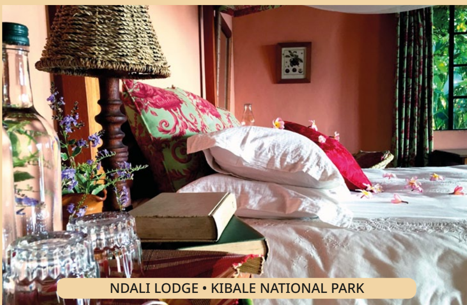
NDALI LODGE • KIBALE NATIONAL PARK