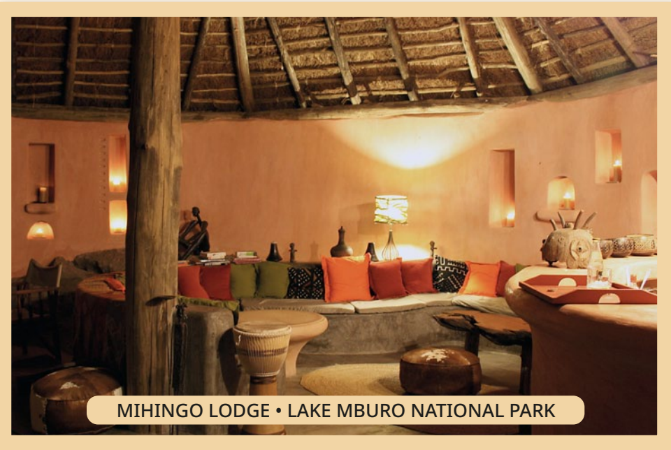
MIHINGO LODGE • LAKE MBURO NATIONAL PARK