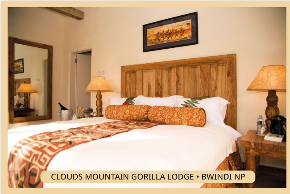
CLOUDS MOUNTAIN GORILLA LODGE • BWINDI NP