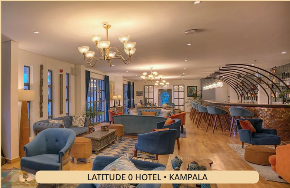
LATITUDE 0 HOTEL • KAMPALA