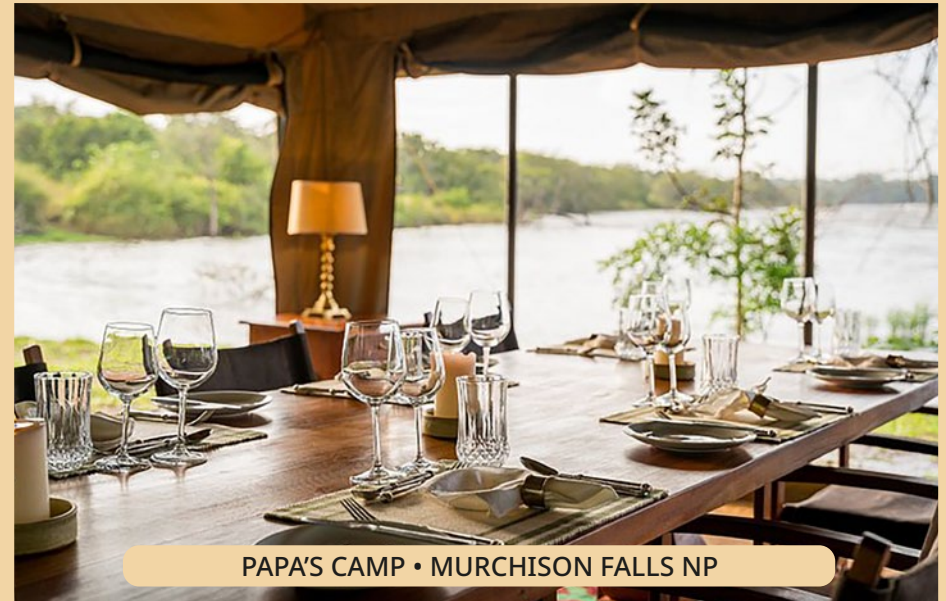
PAPA'S CAMP • MURCHISON FALLS NP