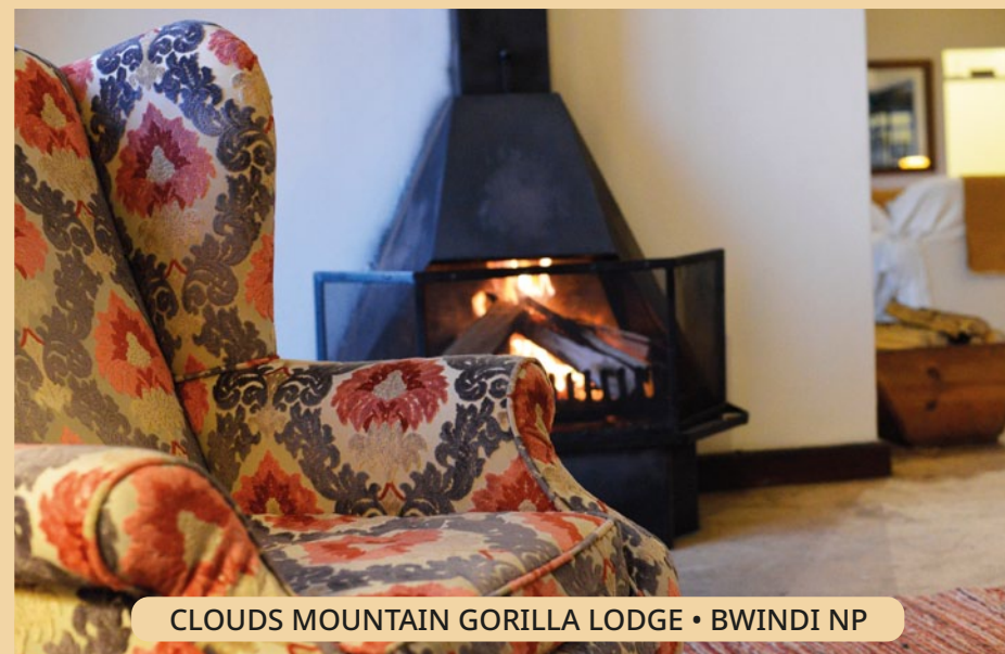
CLOUDS MOUNTAIN GORILLA LODGE • BWINDI NP