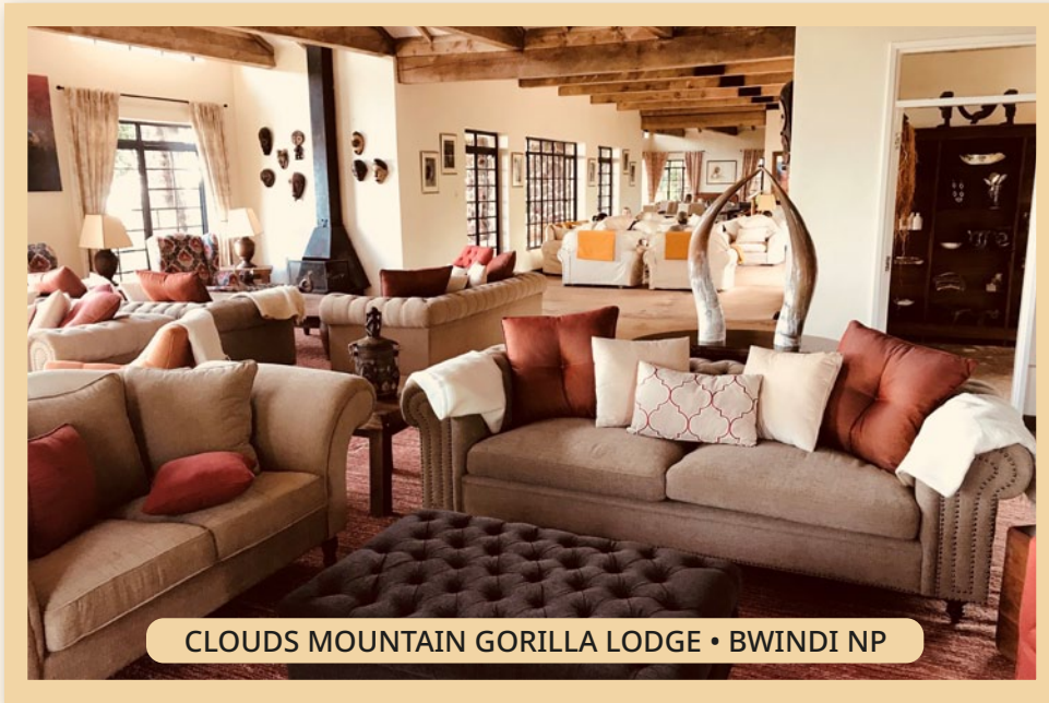
CLOUDS MOUNTAIN GORILLA LODGE • BWINDI NP