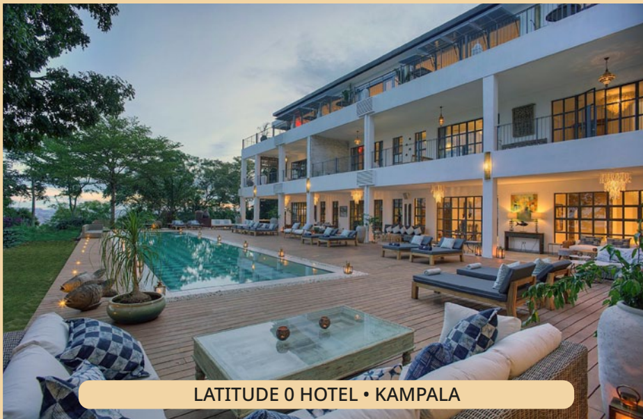
LATITUDE 0 HOTEL • KAMPALA