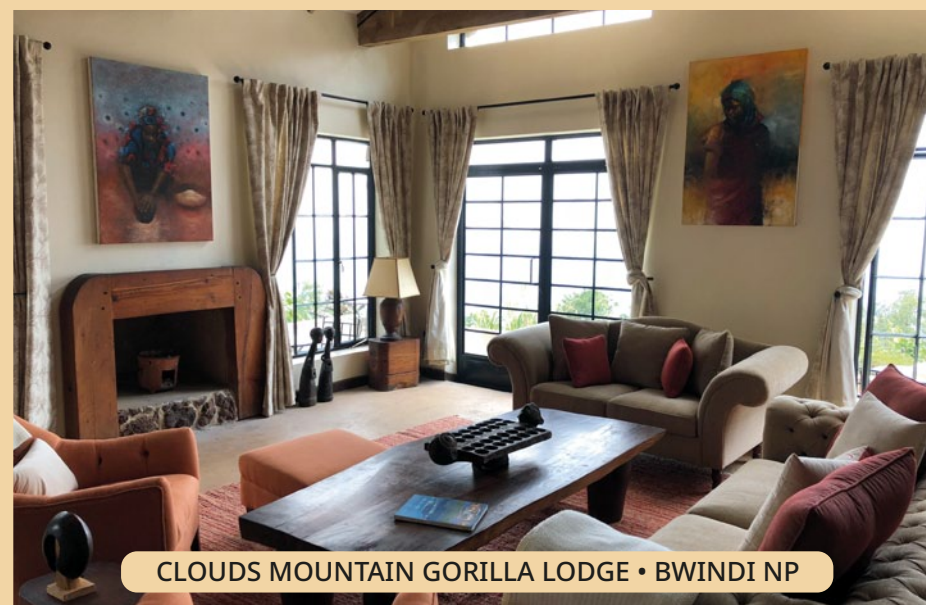
CLOUDS MOUNTAIN GORILLA LODGE • BWINDI NP