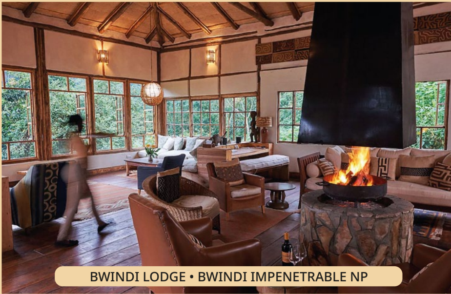
BWINDI LODGE • BWINDI IMPENETRABLE NP