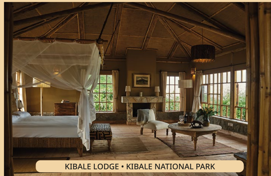
KIBALE LODGE • KIBALE NATIONAL PARK