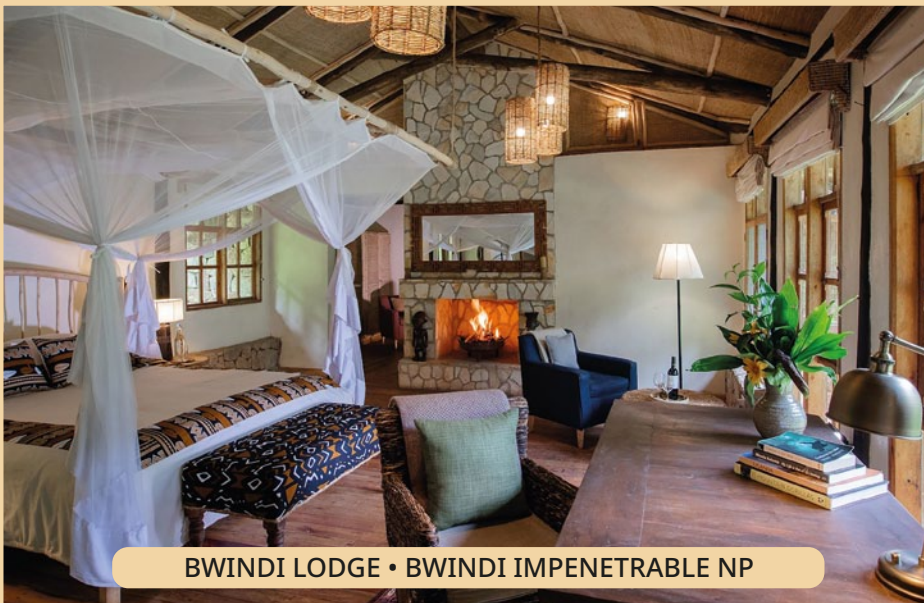
BWINDI LODGE • BWINDI IMPENETRABLE NP