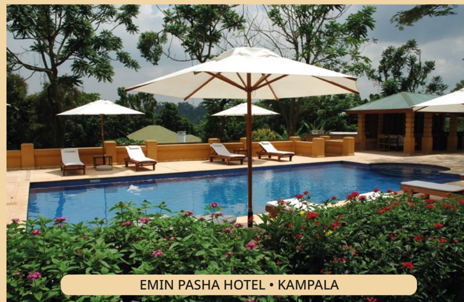
EMIN PASHA HOTEL • KAMPALA