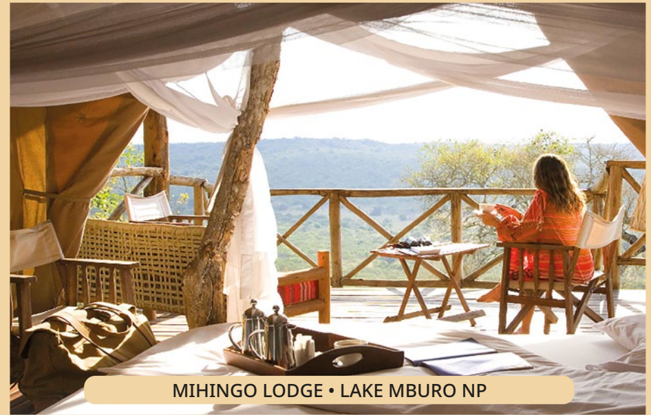
MIHINGO LODGE • LAKE MBURO NP