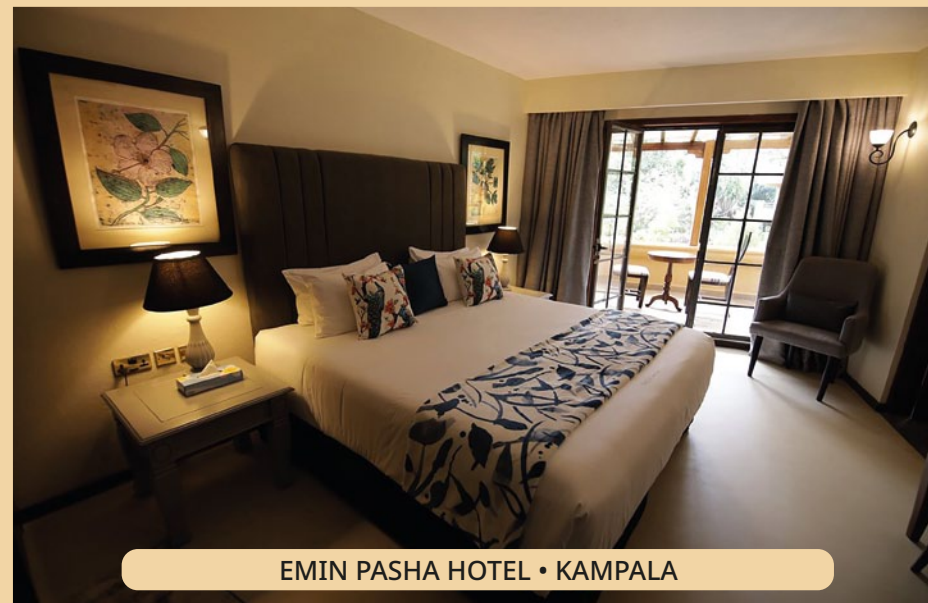
EMIN PASHA HOTEL • KAMPALA