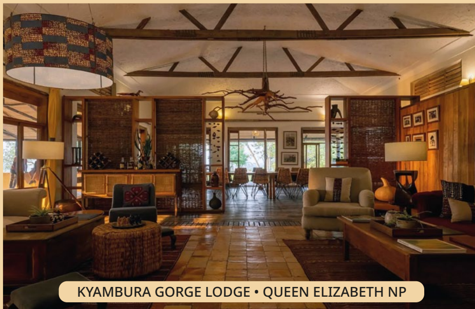
KYAMBURA GORGE LODGE • QUEEN ELIZABETH NP