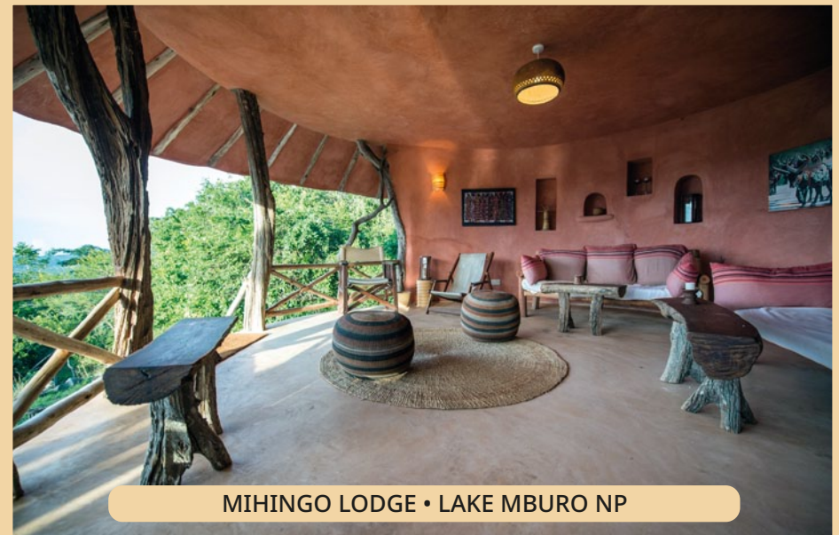
MIHINGO LODGE • LAKE MBURO NP