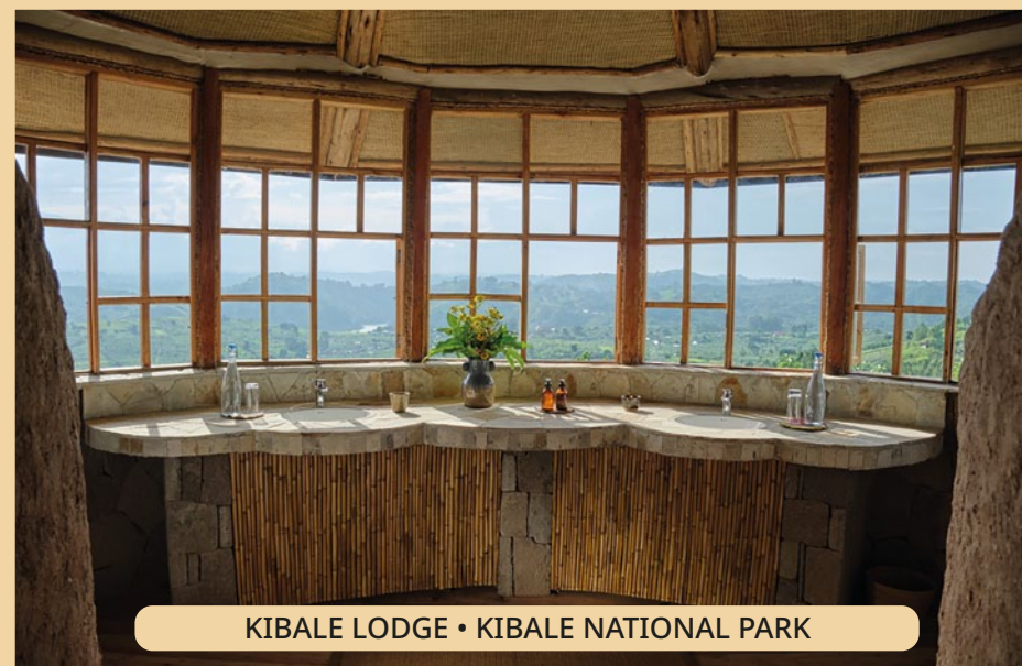
KIBALE LODGE • KIBALE NATIONAL PARK