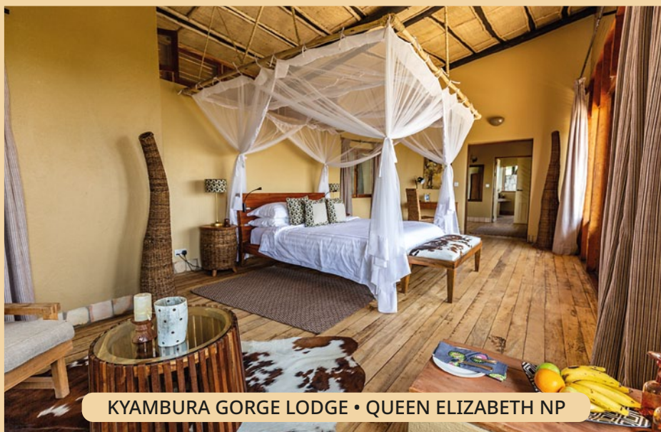
KYAMBURA GORGE LODGE • QUEEN ELIZABETH NP