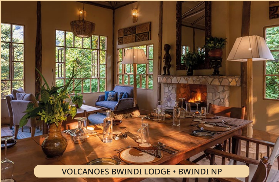
VOLCANOES BWINDI LODGE • BWINDI NP