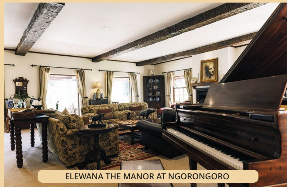
ELEWANA THE MANOR AT NGORONGORO