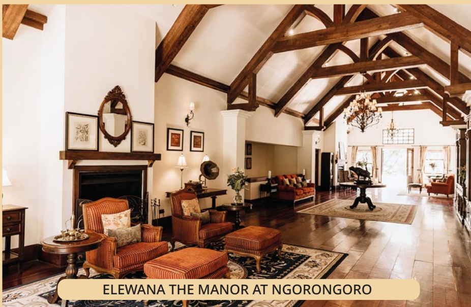
ELEWANA THE MANOR AT NGORONGORO