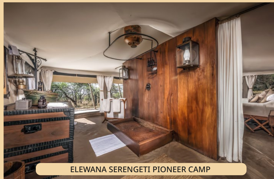
ELEWANA SERENGETI PIONEER CAMP