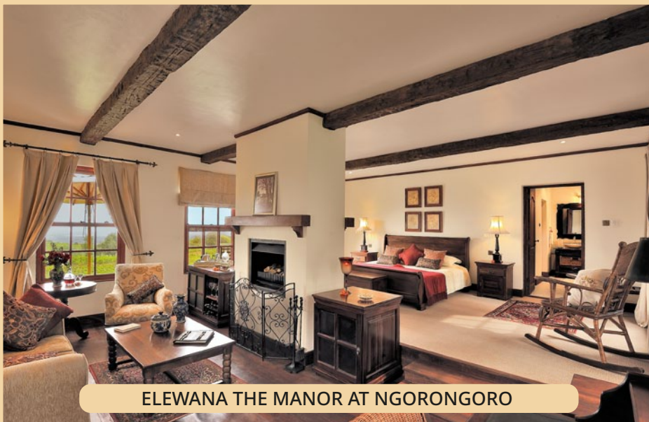
ELEWANA THE MANOR AT NGORONGORO