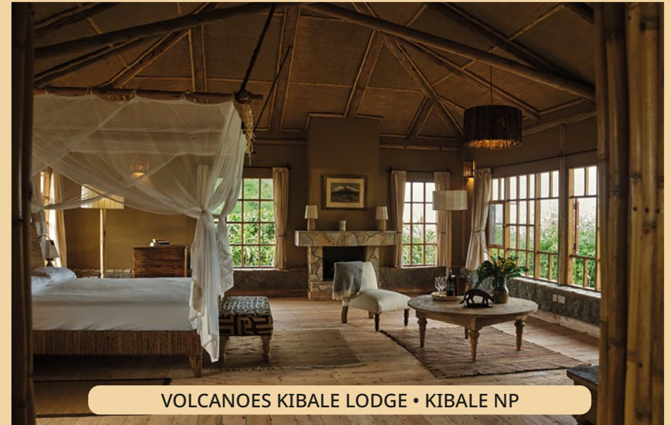
VOLCANOES KIBALE LODGE • KIBALE NP