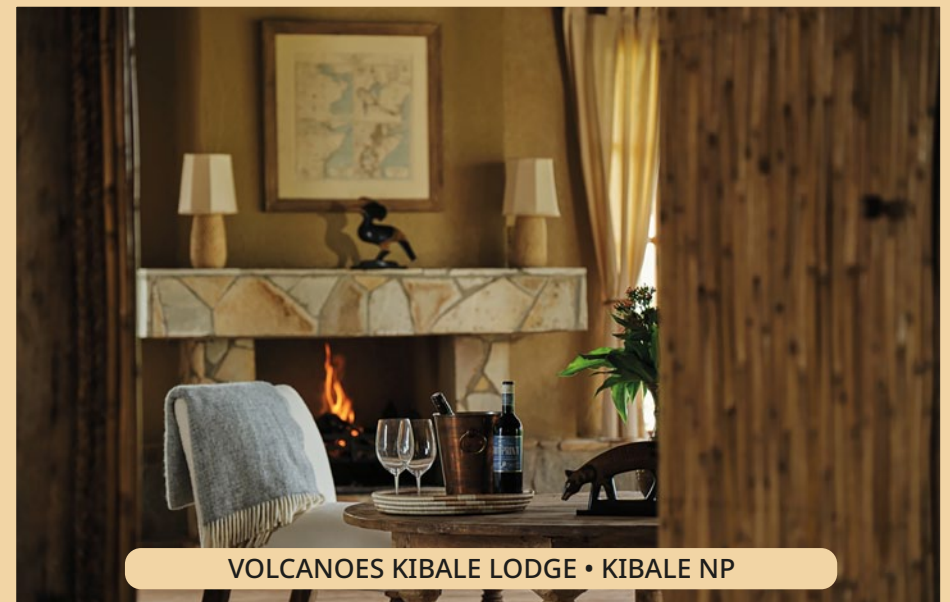
VOLCANOES KIBALE LODGE • KIBALE NP