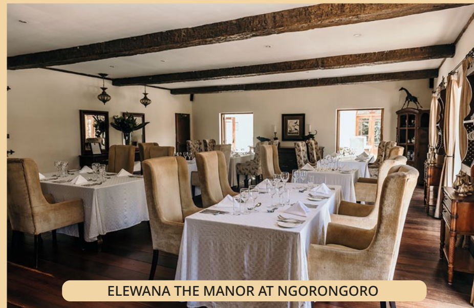
ELEWANA THE MANOR AT NGORONGORO