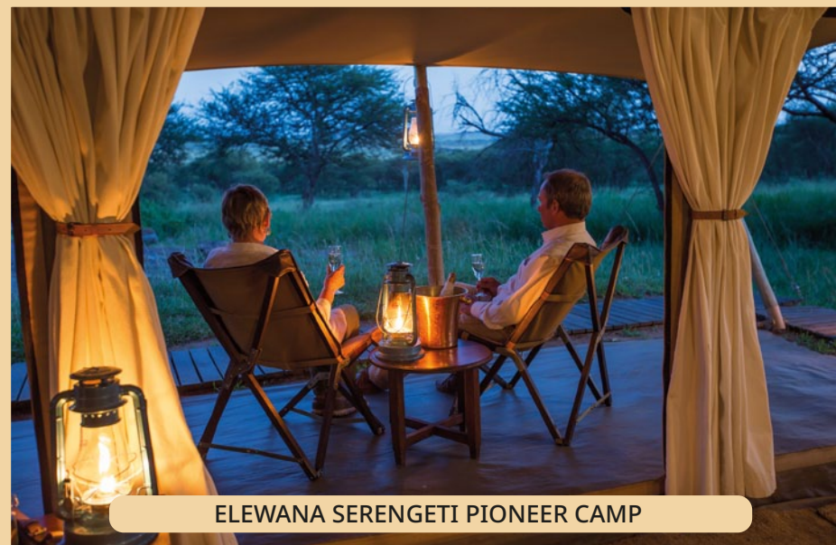
ELEWANA SERENGETI PIONEER CAMP