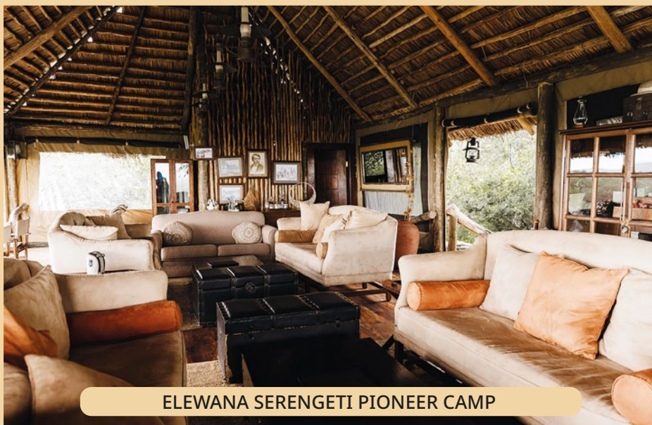
ELEWANA SERENGETI PIONEER CAMP