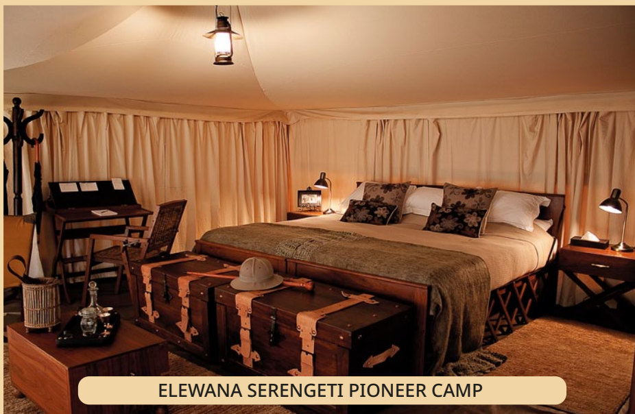
ELEWANA SERENGETI PIONEER CAMP