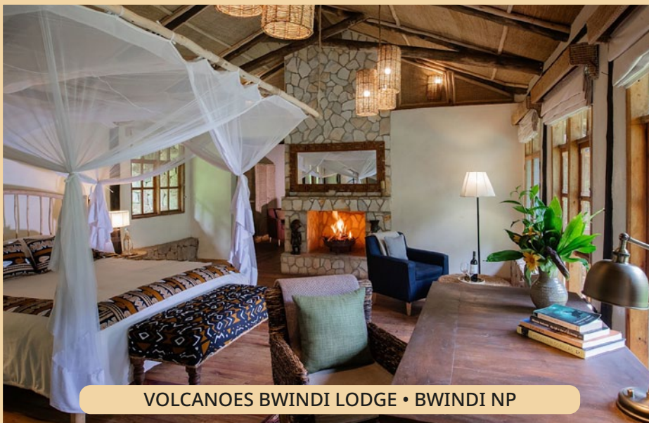
VOLCANOES BWINDI LODGE • BWINDI NP