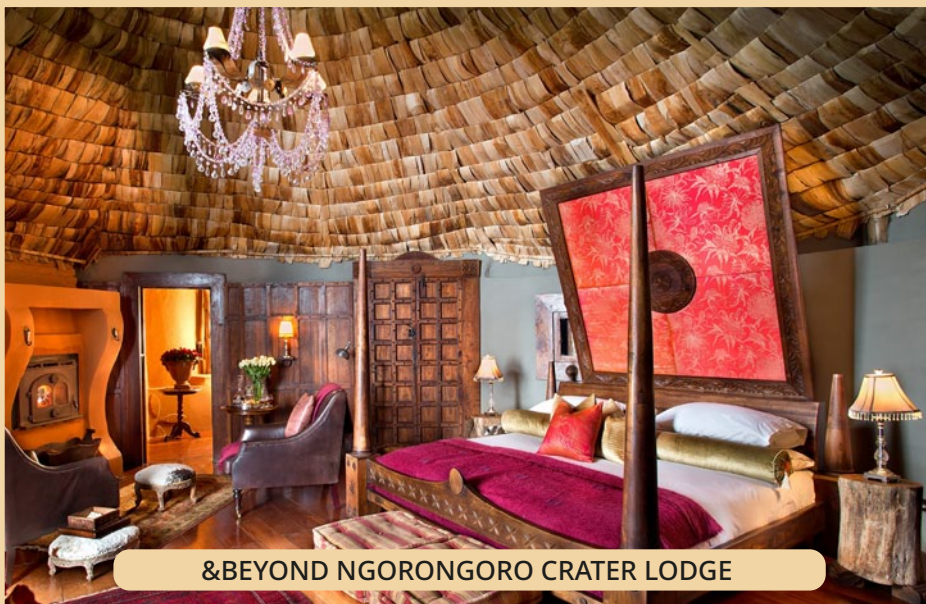
&BEYOND NGORONGORO CRATER LODGE