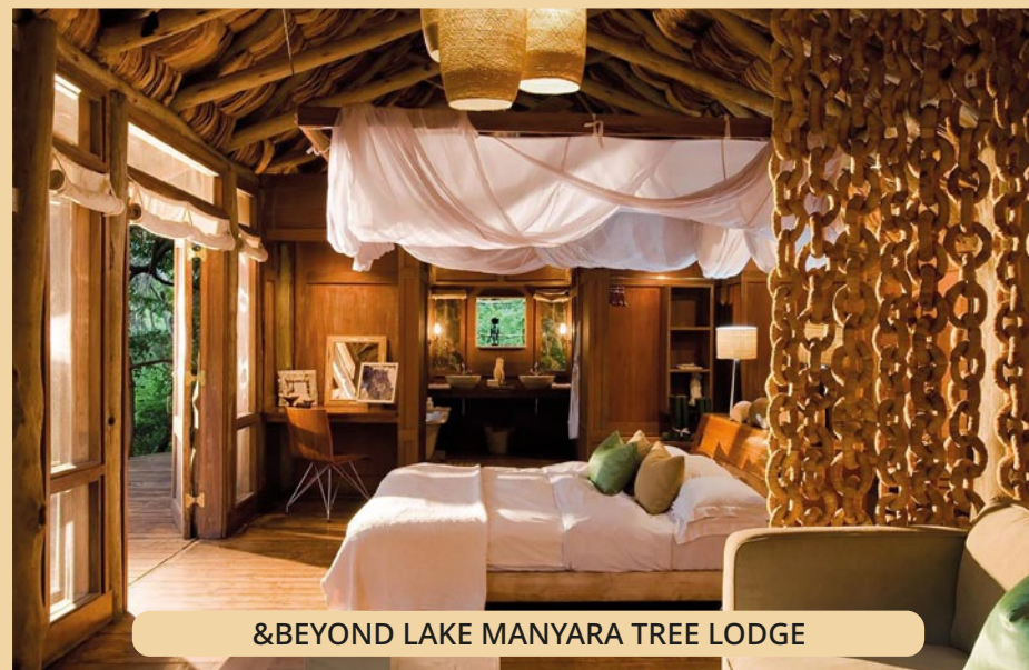
&BEYOND LAKE MANYARA TREE LODGE

Next Pages: Sample Photos 5 Star Lodges Tanzania and Uganda