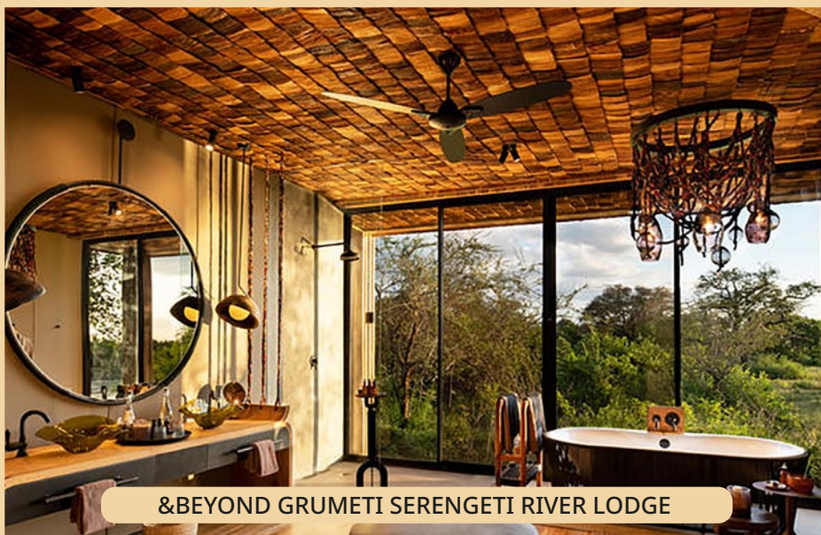
&BEYOND GRUMETI SERENGETI RIVER LODGE