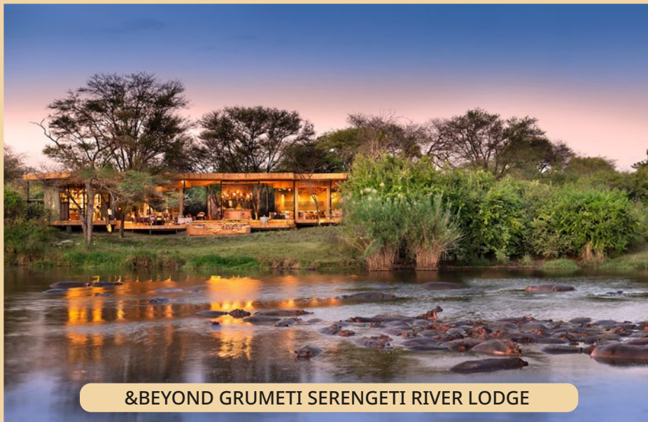
&BEYOND GRUMETI SERENGETI RIVER LODGE