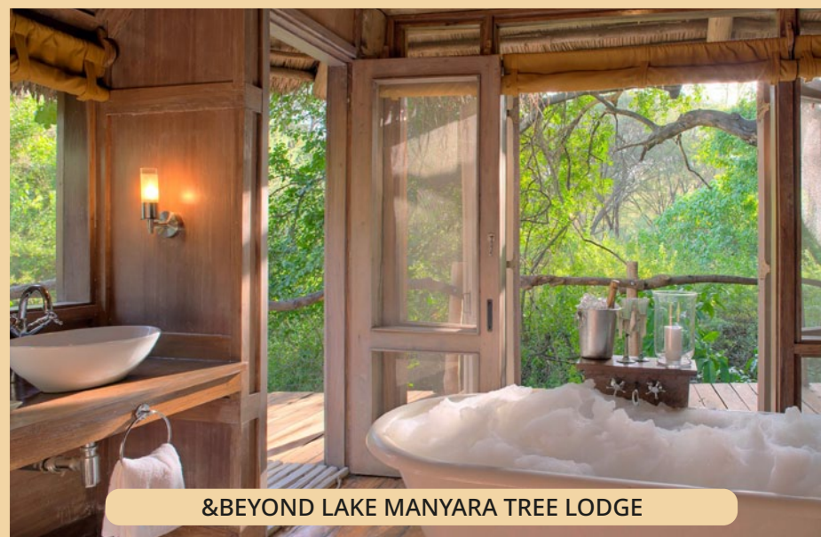
&BEYOND LAKE MANYARA TREE LODGE