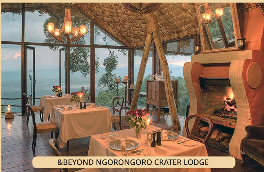
&BEYOND NGORONGORO CRATER LODGE