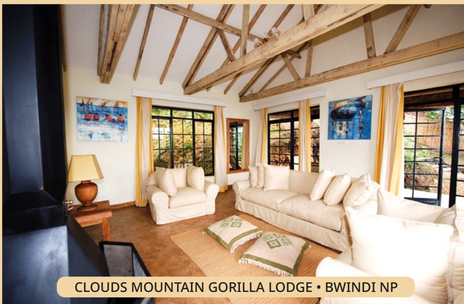
CLOUDS MOUNTAIN GORILLA LODGE • BWINDI NP