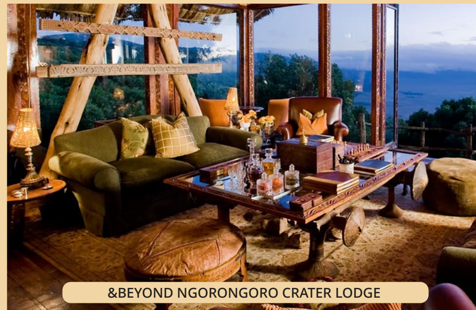
&BEYOND NGORONGORO CRATER LODGE