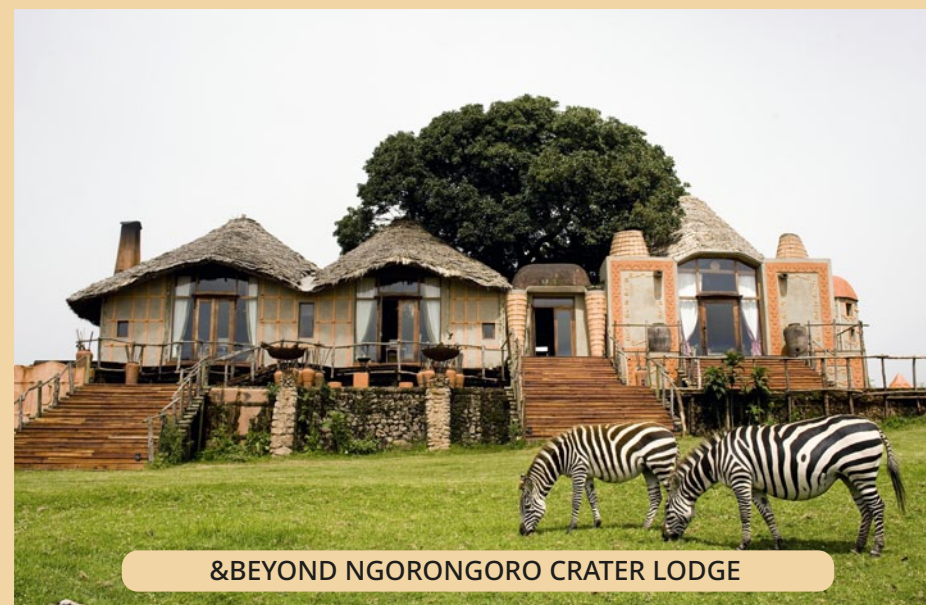
&BEYOND NGORONGORO CRATER LODGE