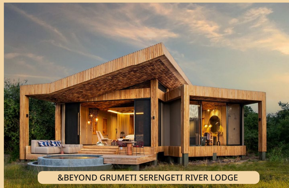
&BEYOND GRUMETI SERENGETI RIVER LODGE