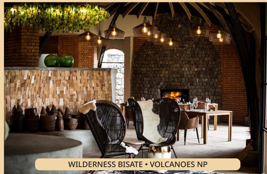
WILDERNESS BISATE • VOLCANOES NP