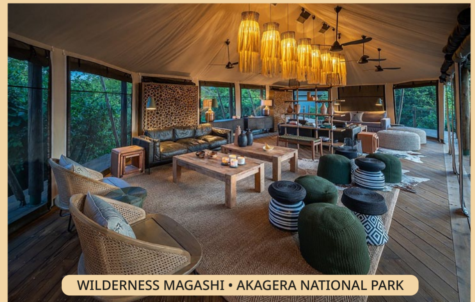
WILDERNESS MAGASHI • AKAGERA NATIONAL PARK