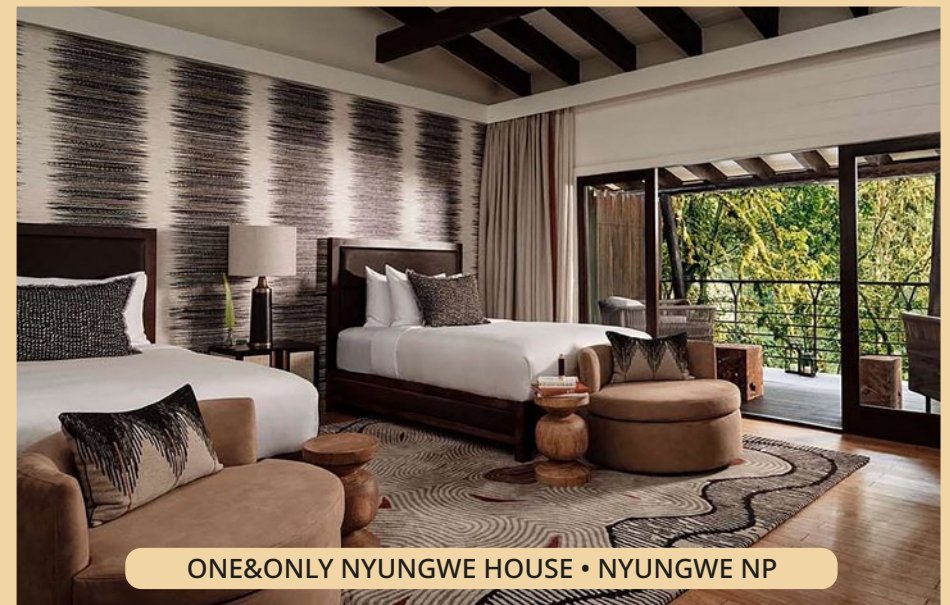
ONE&ONLY NYUNGWE HOUSE • NYUNGWE NP