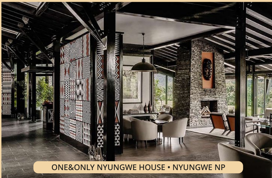
ONE&ONLY NYUNGWE HOUSE • NYUNGWE NP