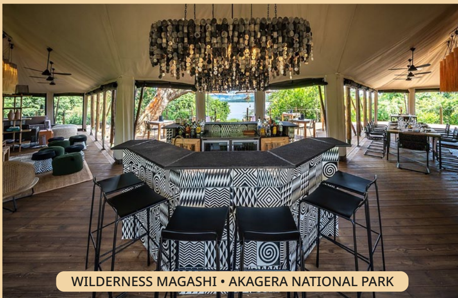
WILDERNESS MAGASHI • AKAGERA NATIONAL PARK