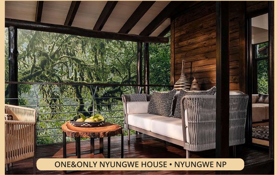
ONE&ONLY NYUNGWE HOUSE • NYUNGWE NP