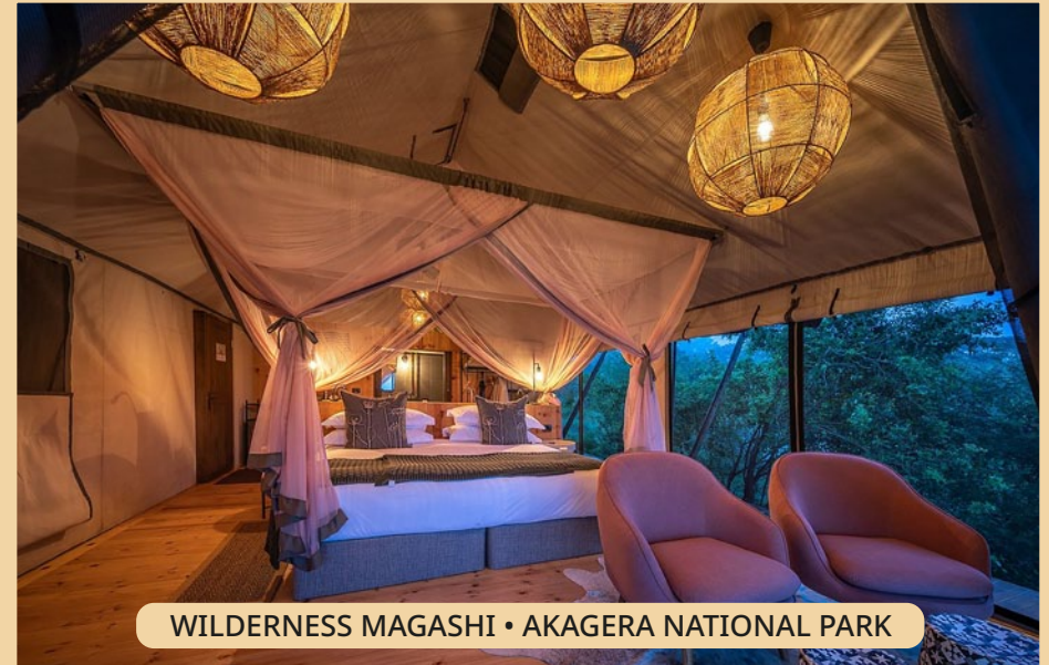
WILDERNESS MAGASHI • AKAGERA NATIONAL PARK

Next Pages: Sample Photos 5 Star Lodges Rwanda