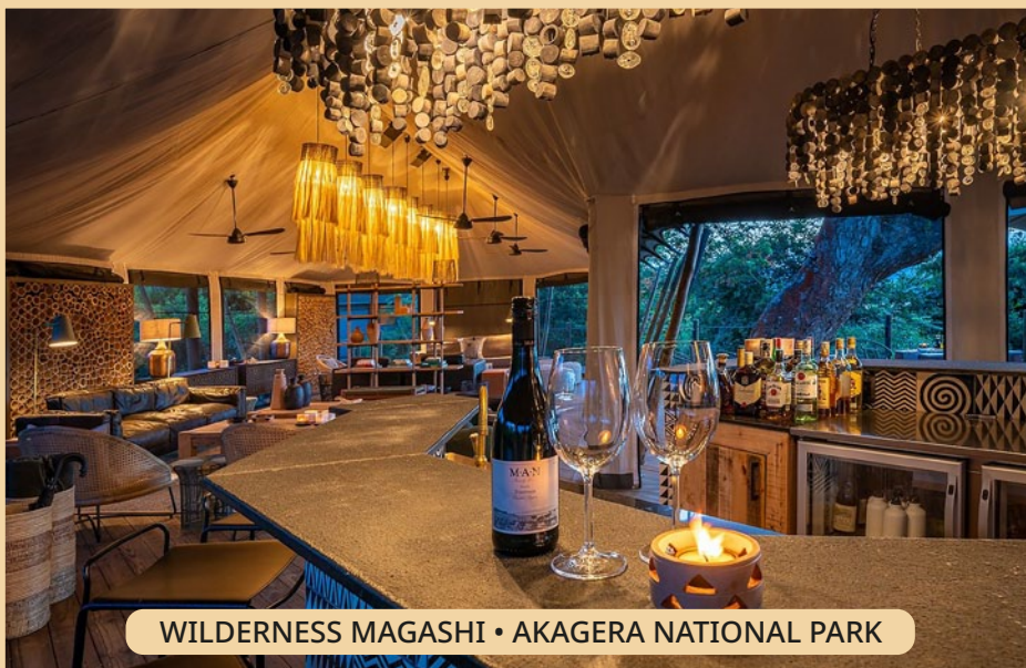
WILDERNESS MAGASHI • AKAGERA NATIONAL PARK