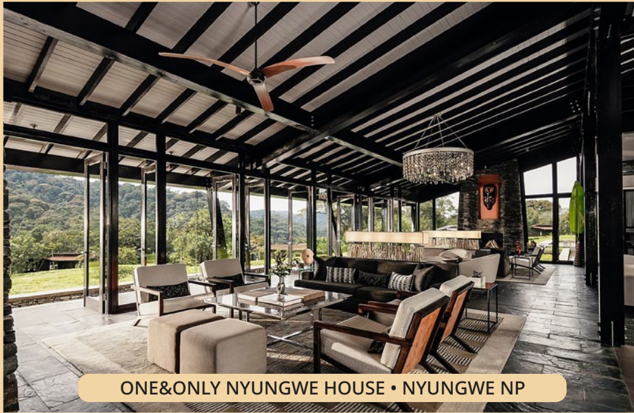
ONE&ONLY NYUNGWE HOUSE • NYUNGWE NP