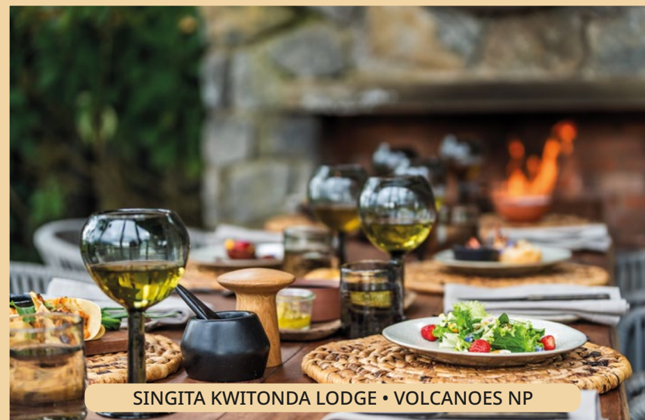
SINGITA KWITONDA LODGE • VOLCANOES NP