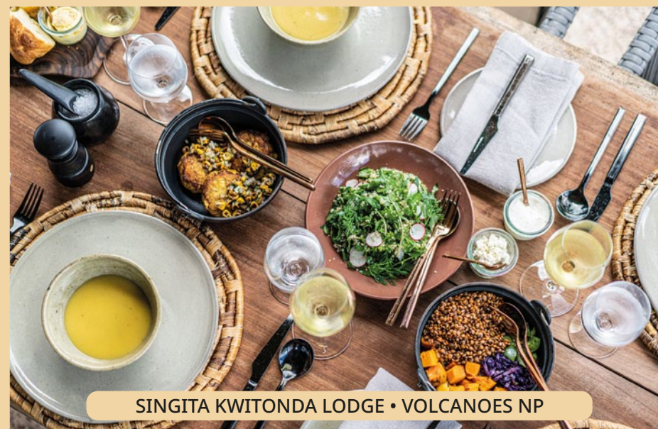
SINGITA KWITONDA LODGE • VOLCANOES NP