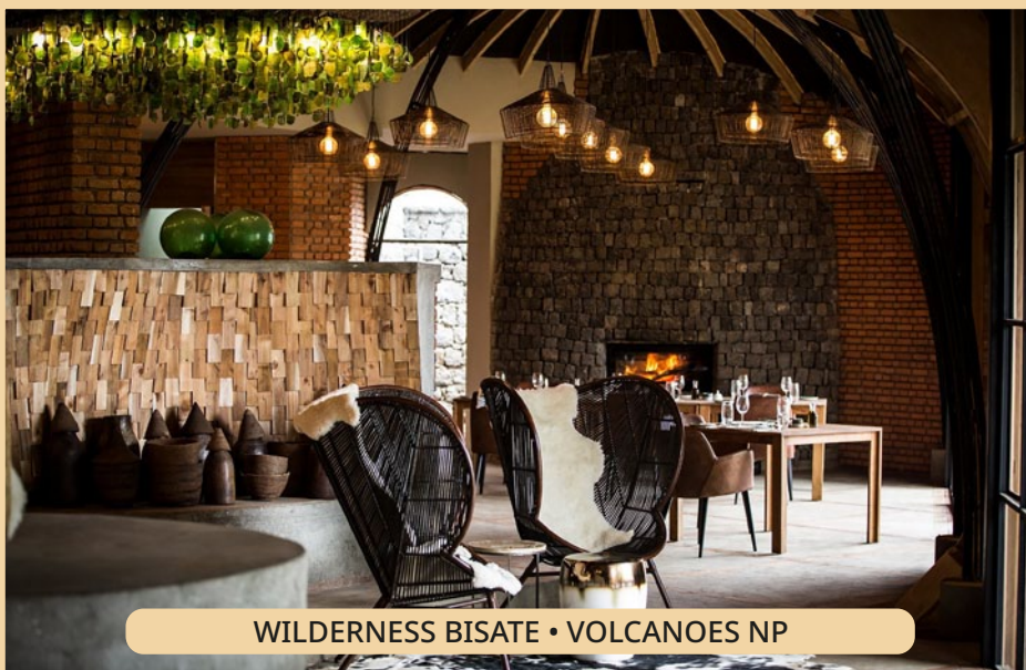
WILDERNESS BISATE • VOLCANOES NP