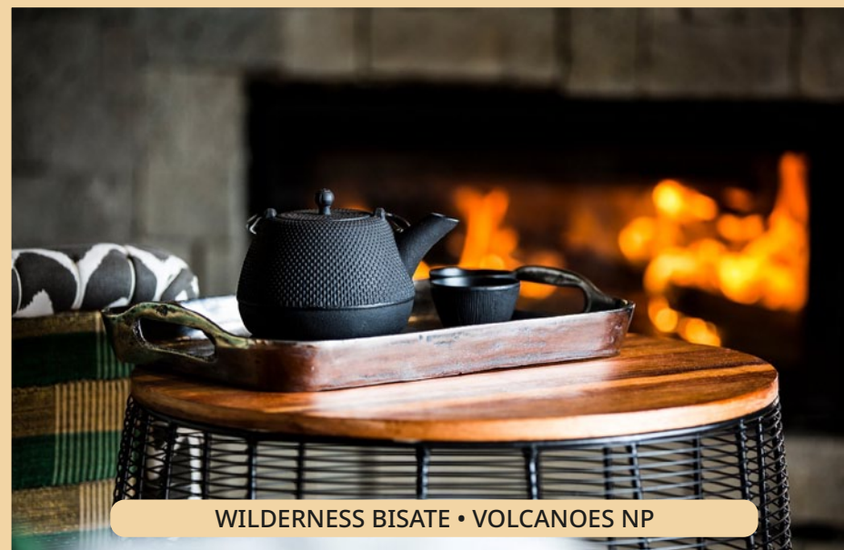
WILDERNESS BISATE • VOLCANOES NP