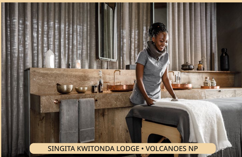
SINGITA KWITONDA LODGE • VOLCANOES NP