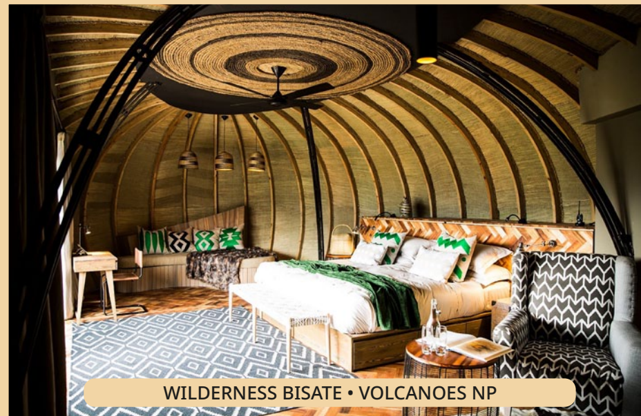
WILDERNESS BISATE • VOLCANOES NP