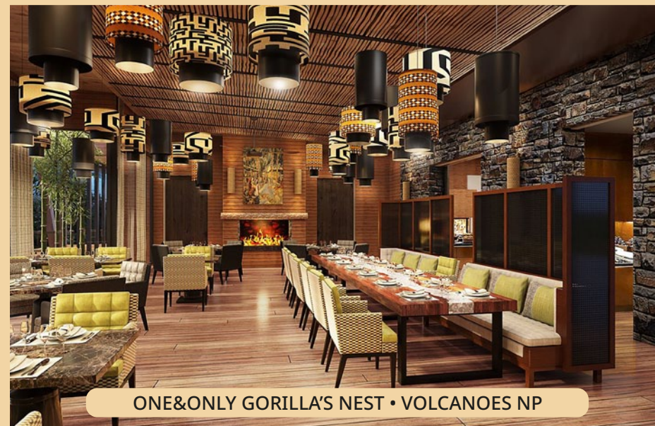
ONE&ONLY GORILLA'S NEST • VOLCANOES NP