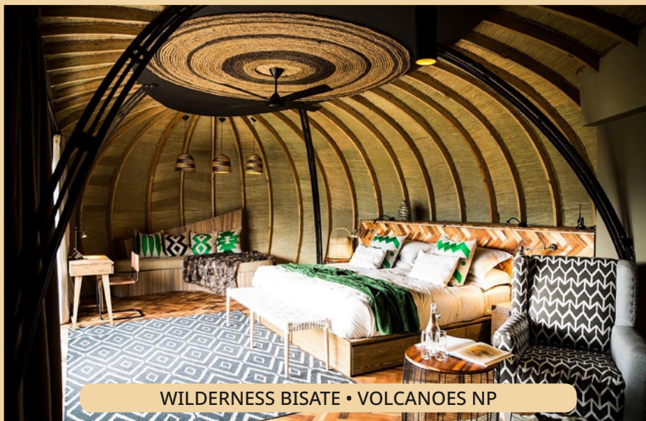
WILDERNESS BISATE • VOLCANOES NP