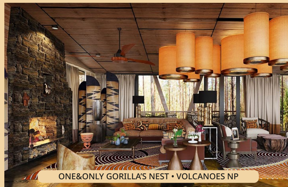
ONE&ONLY GORILLA'S NEST • VOLCANOES NP