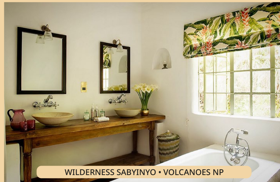
WILDERNESS SABYINYO • VOLCANOES NP