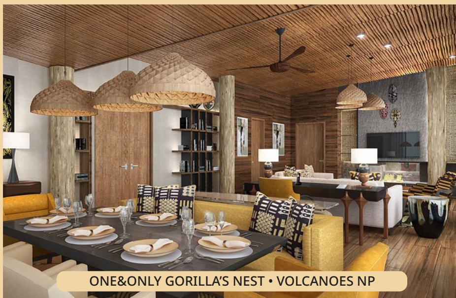
ONE&ONLY GORILLA'S NEST • VOLCANOES NP