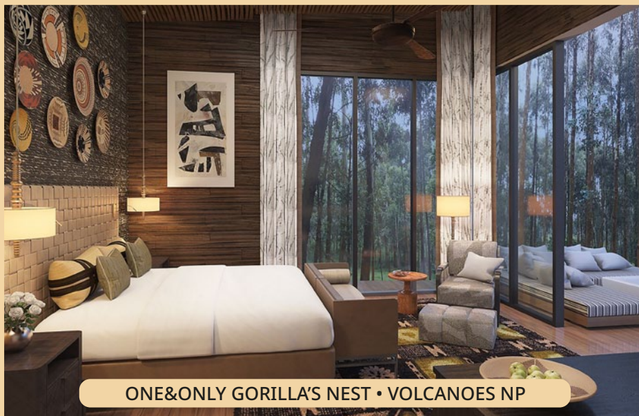
ONE&ONLY GORILLA'S NEST • VOLCANOES NP