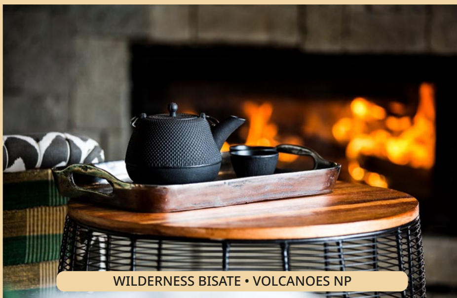
WILDERNESS BISATE • VOLCANOES NP