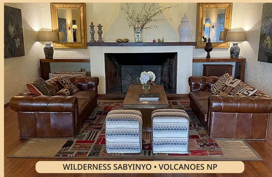
WILDERNESS SABYINYO • VOLCANOES NP