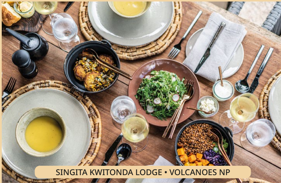
SINGITA KWITONDA LODGE • VOLCANOES NP