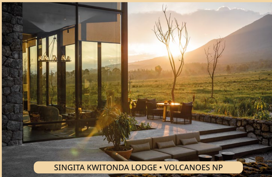
SINGITA KWITONDA LODGE • VOLCANOES NP