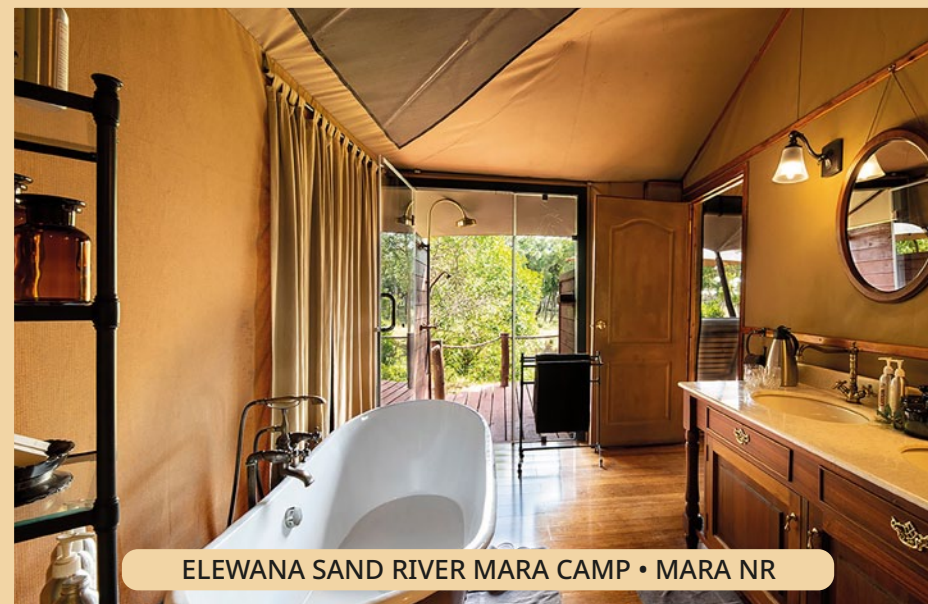
ELEWANA SAND RIVER MARA CAMP • MARA NR