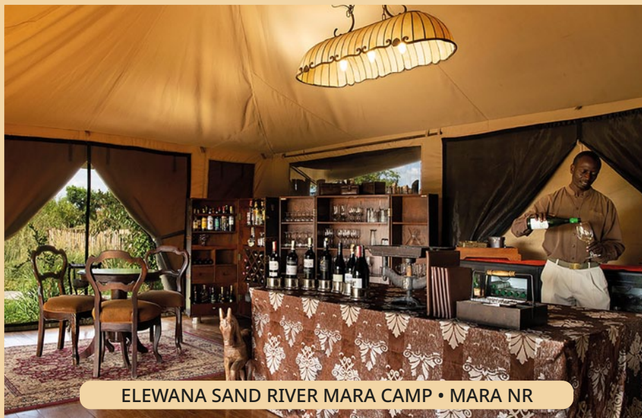
ELEWANA SAND RIVER MARA CAMP • MARA NR