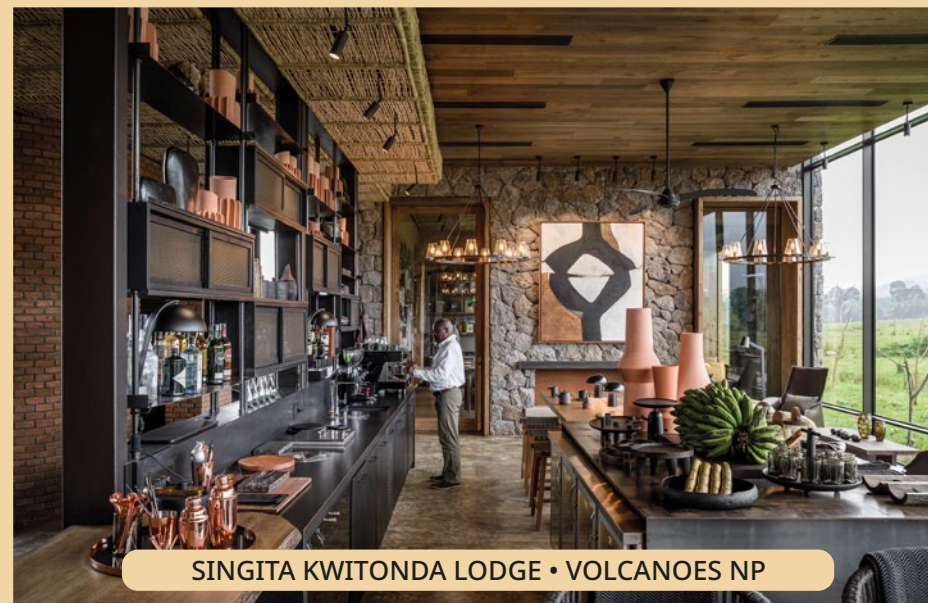
SINGITA KWITONDA LODGE • VOLCANOES NP