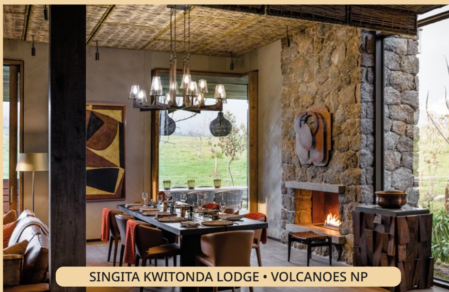
SINGITA KWITONDA LODGE • VOLCANOES NP