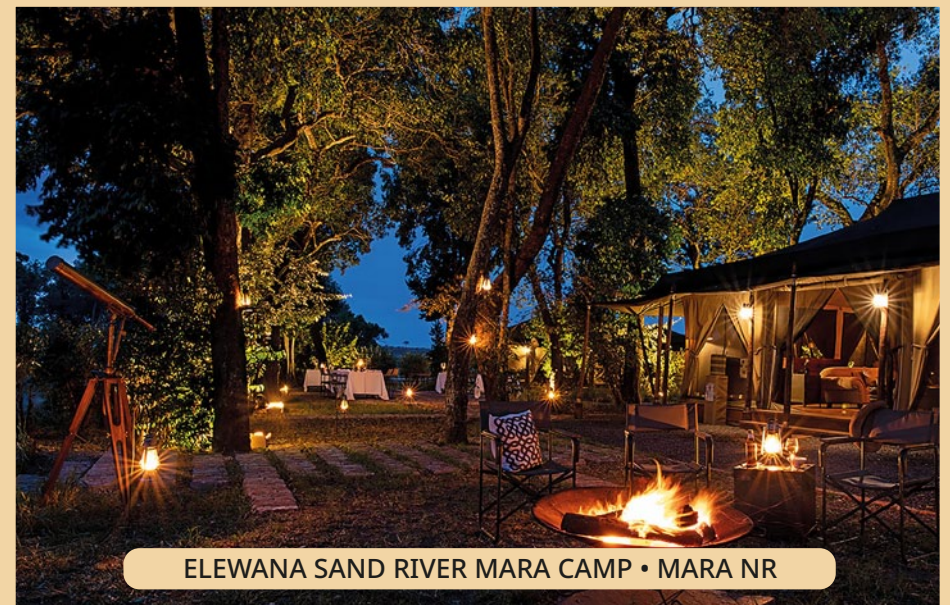
ELEWANA SAND RIVER MARA CAMP • MARA NR