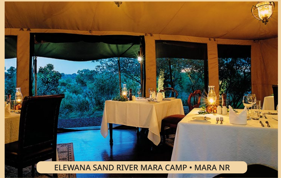
ELEWANA SAND RIVER MARA CAMP • MARA NR