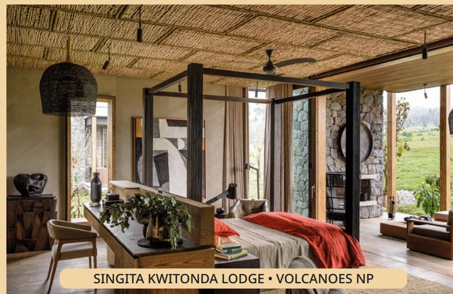
SINGITA KWITONDA LODGE • VOLCANOES NP