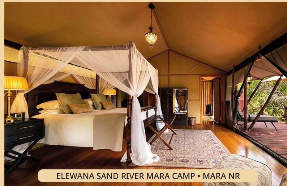
ELEWANA SAND RIVER MARA CAMP • MARA NR