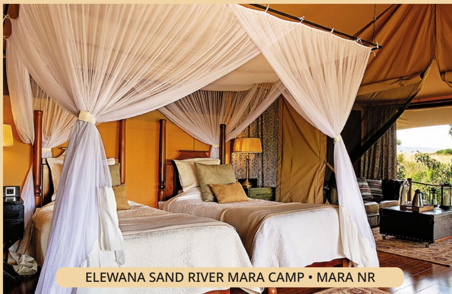
ELEWANA SAND RIVER MARA CAMP • MARA NR