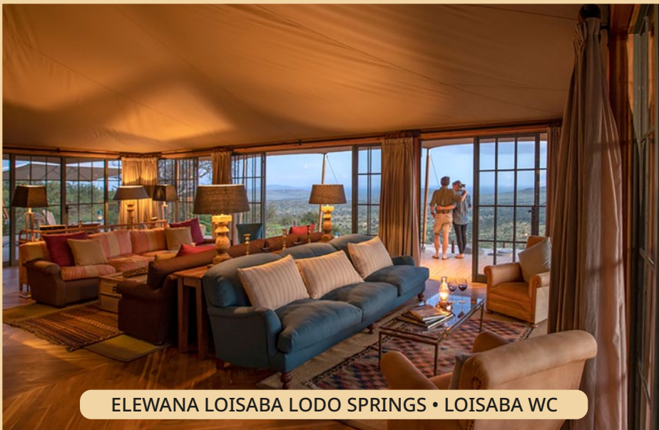
ELEWANA LOISABA LODO SPRINGS • LOISABA WC