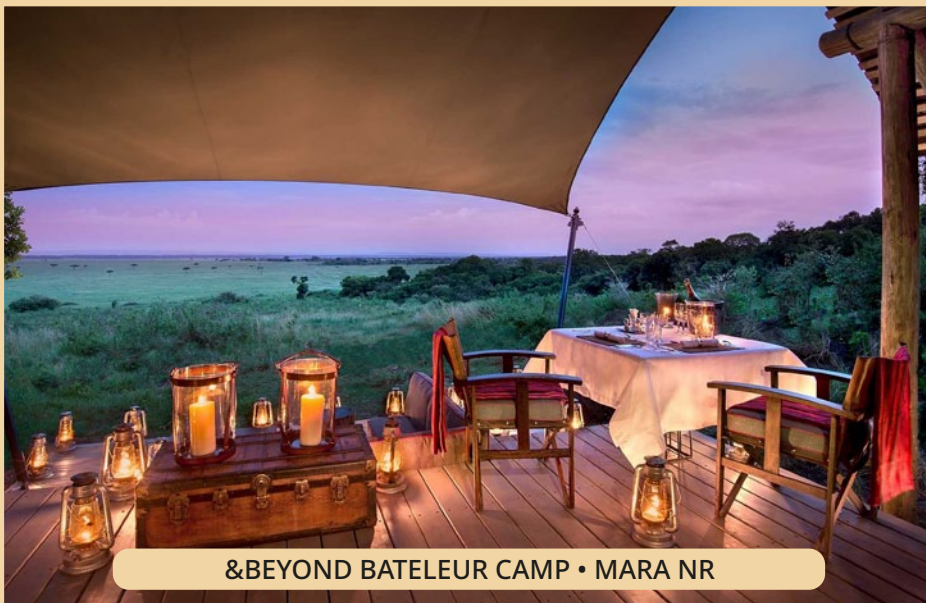
&BEYOND BATELEUR CAMP • MARA NR