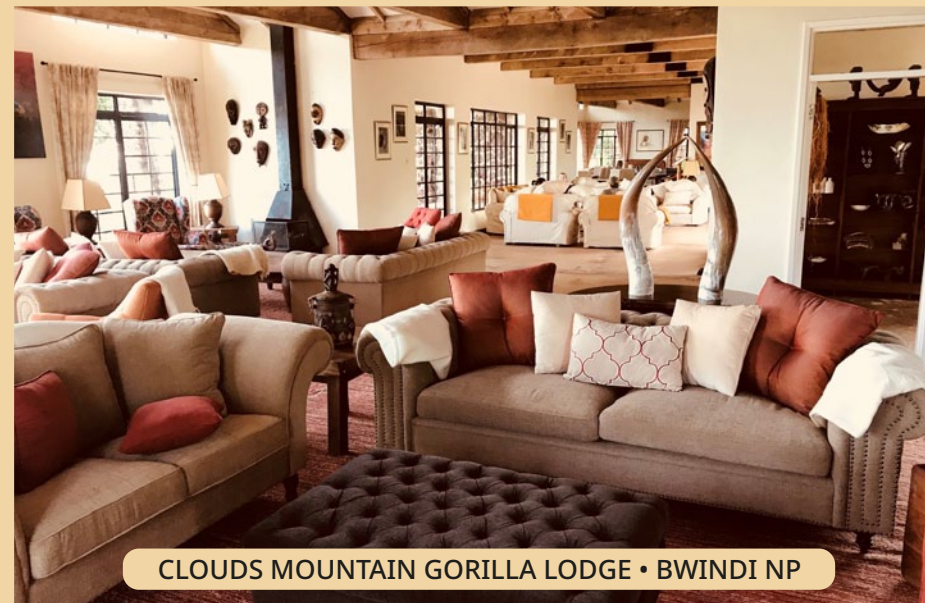
CLOUDS MOUNTAIN GORILLA LODGE • BWINDI NP