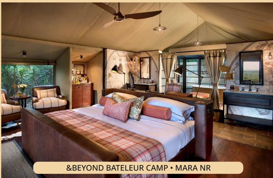
&BEYOND BATELEUR CAMP • MARA NR