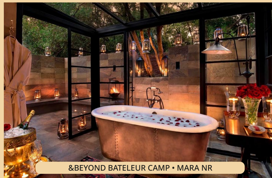
&BEYOND BATELEUR CAMP • MARA NR