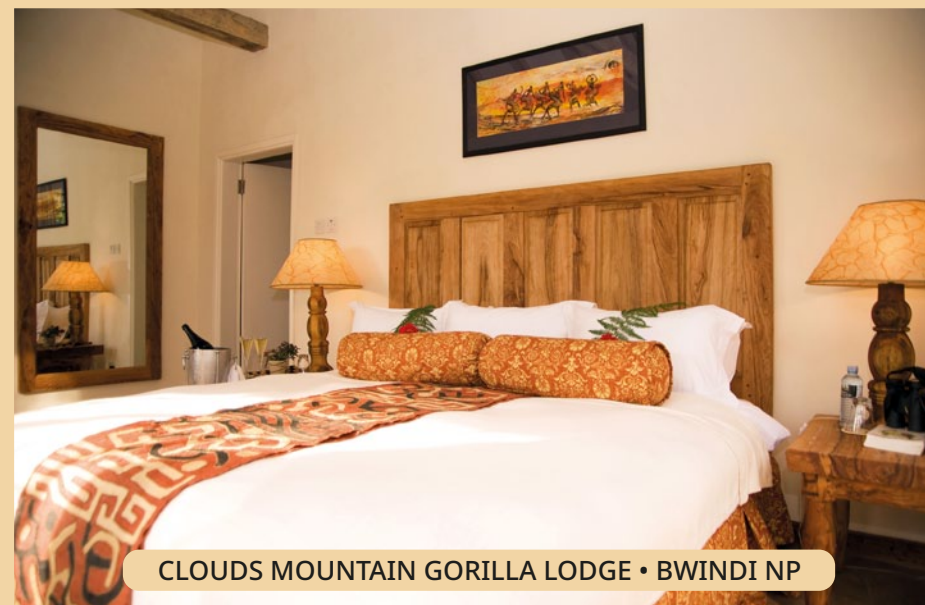
CLOUDS MOUNTAIN GORILLA LODGE • BWINDI NP