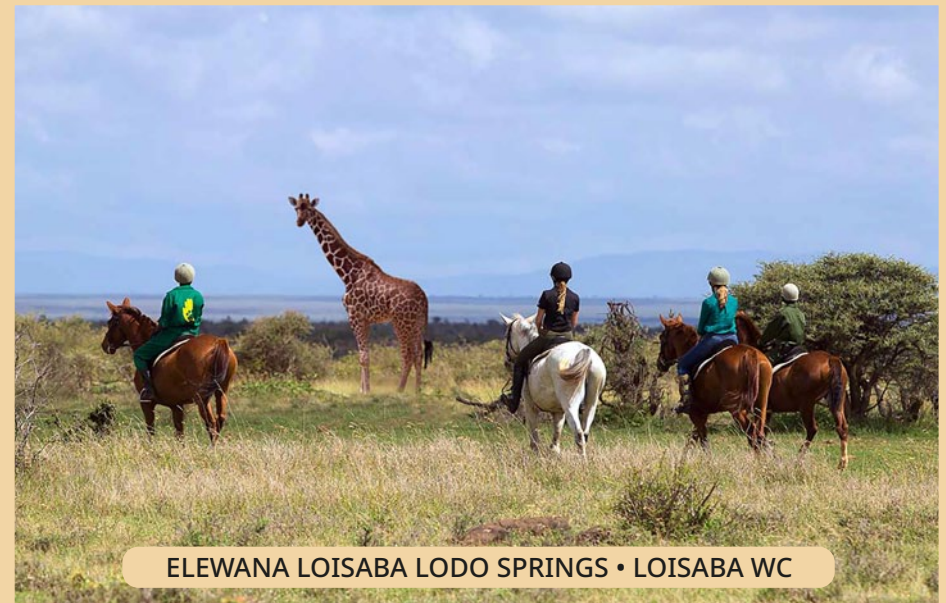
ELEWANA LOISABA LODO SPRINGS • LOISABA WC