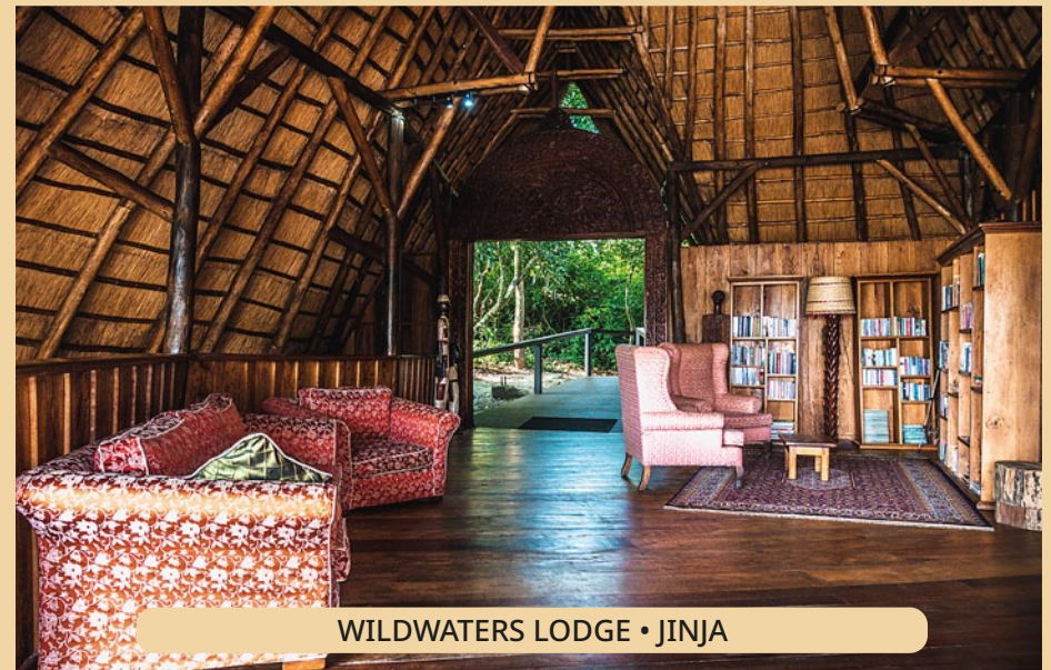
WILDWATERS LODGE • JINJA