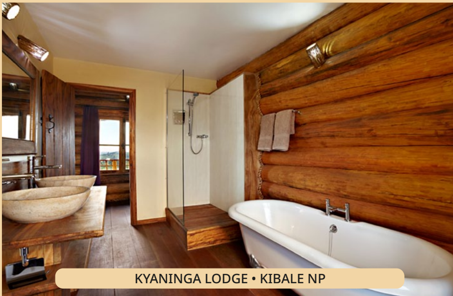
KYANINGA LODGE • KIBALE NP