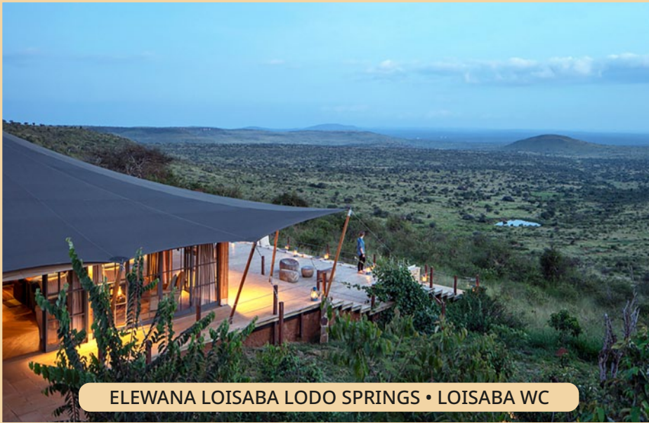
ELEWANA LOISABA LODO SPRINGS • LOISABA WC