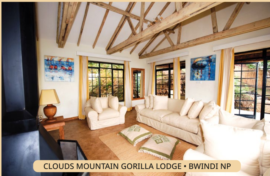
CLOUDS MOUNTAIN GORILLA LODGE • BWINDI NP