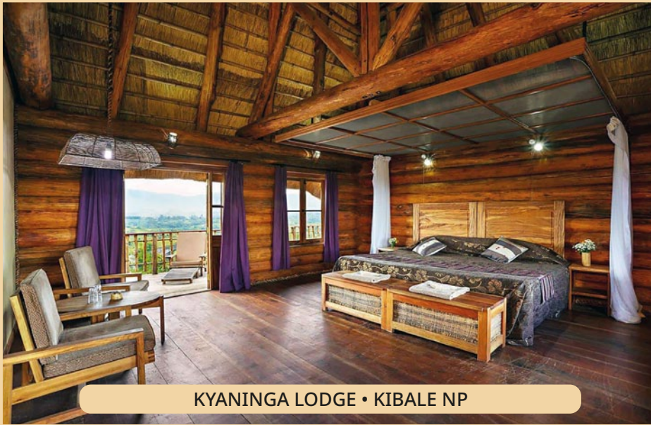
KYANINGA LODGE • KIBALE NP