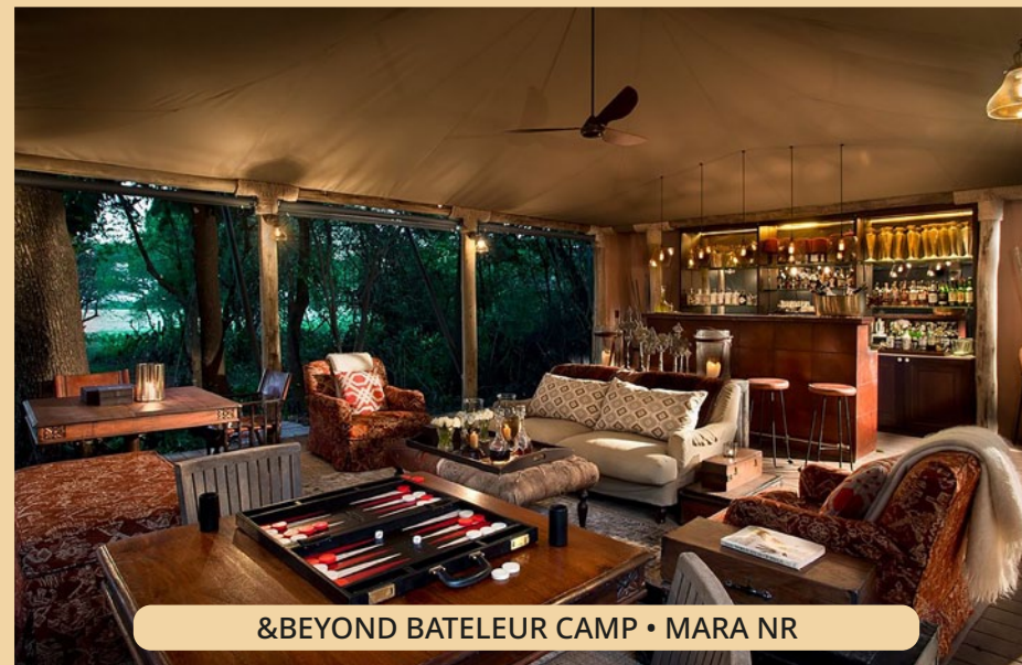
&BEYOND BATELEUR CAMP • MARA NR