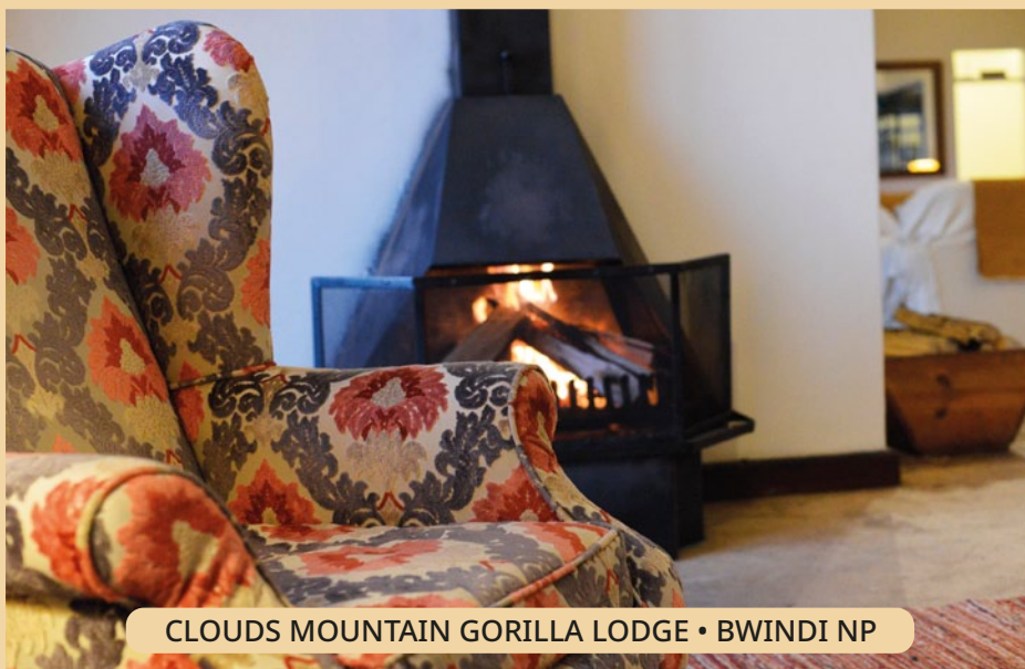
CLOUDS MOUNTAIN GORILLA LODGE • BWINDI NP