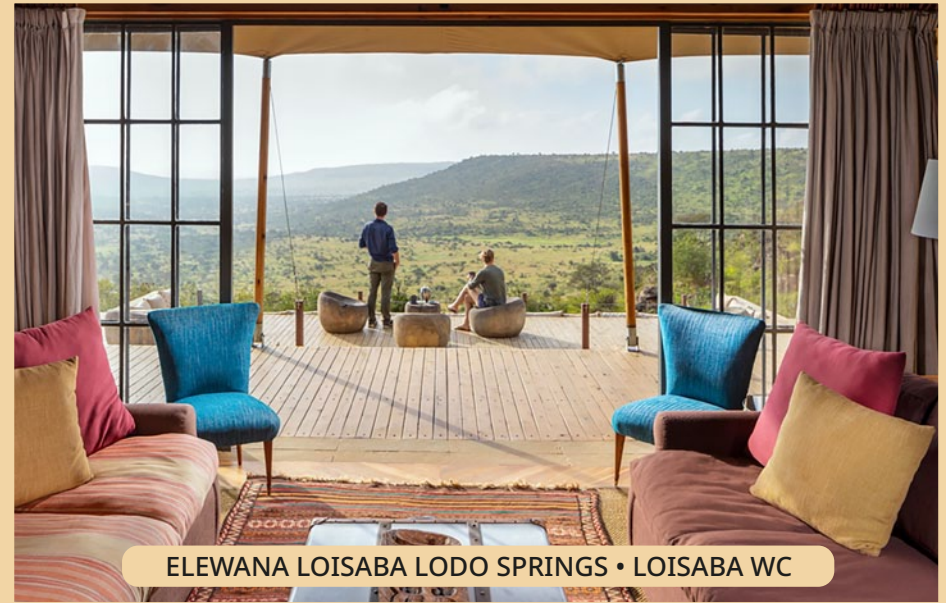
ELEWANA LOISABA LODO SPRINGS • LOISABA WC