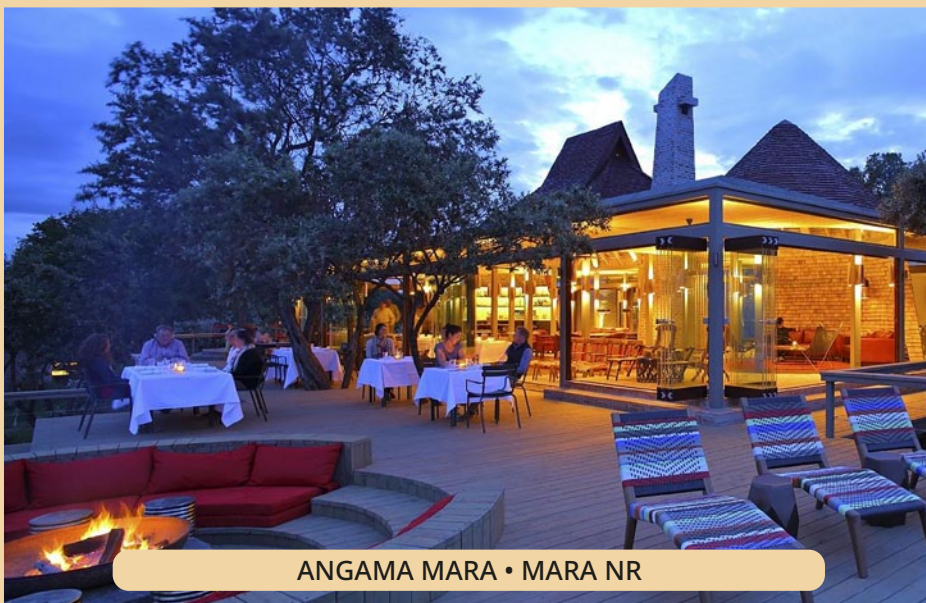
ANGAMA MARA • MARA NR