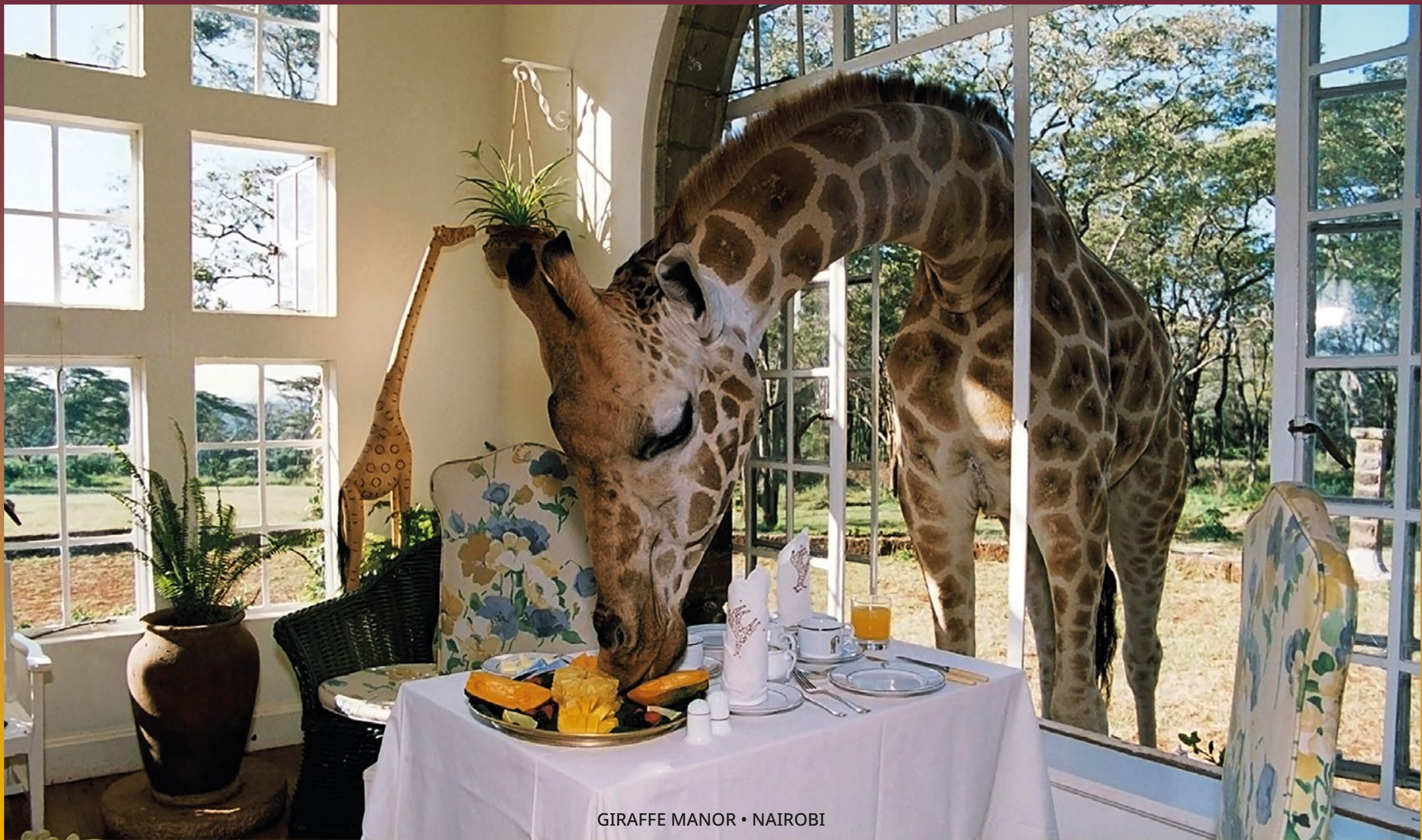
GIRAFFE MANOR • NAIROBI