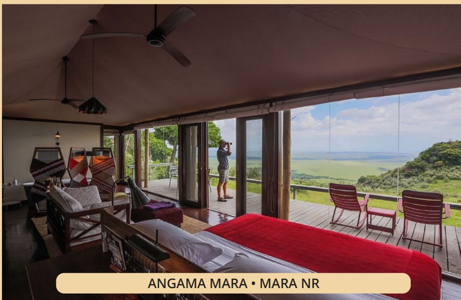
ANGAMA MARA • MARA NR