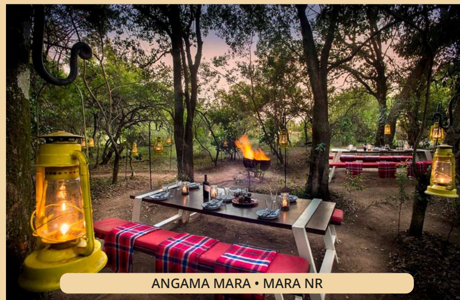
ANGAMA MARA • MARA NR