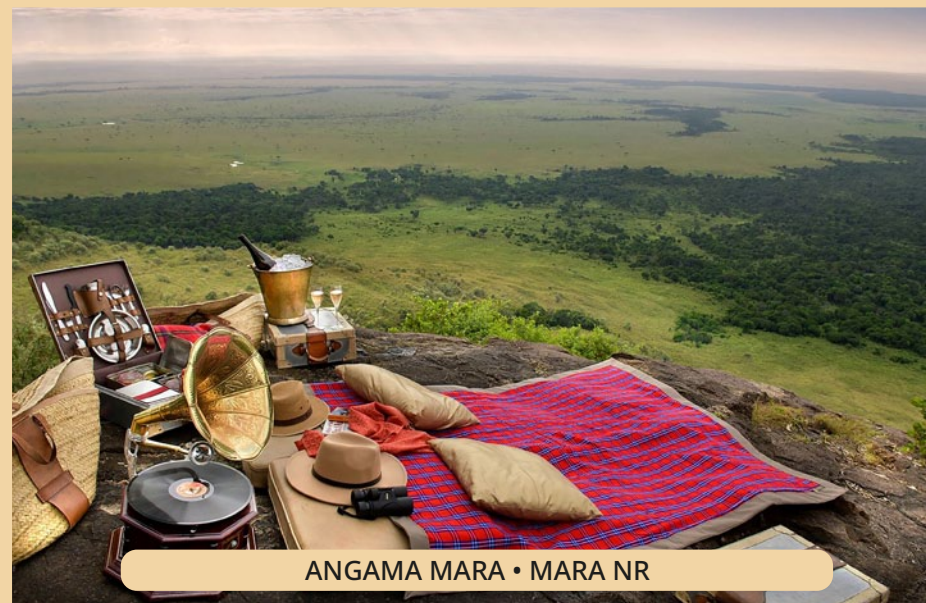
ANGAMA MARA • MARA NR