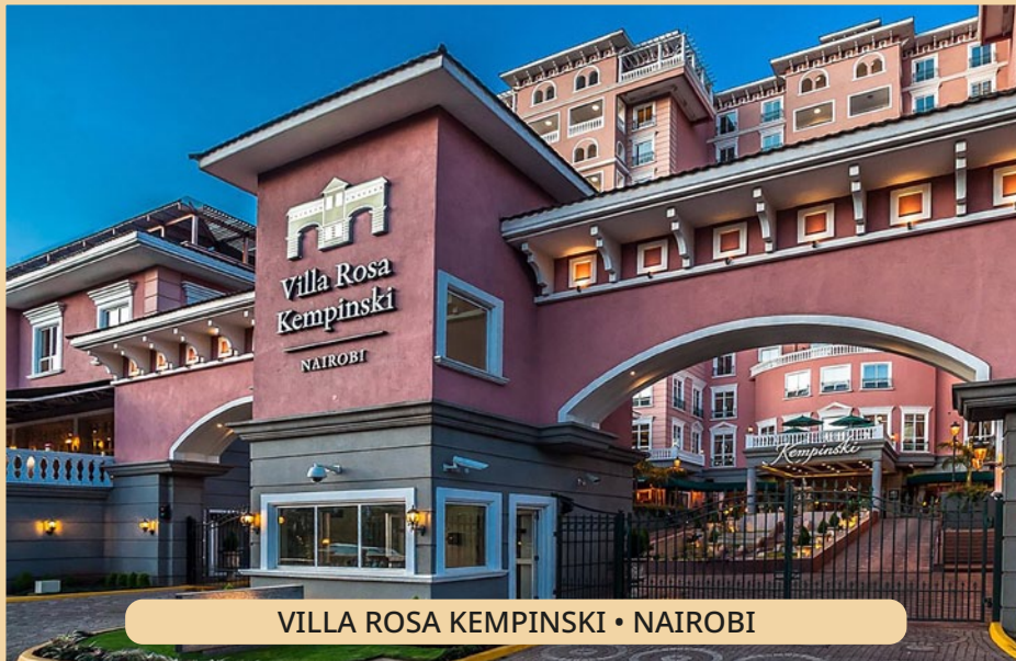
VILLA ROSA KEMPINSKI • NAIROBI