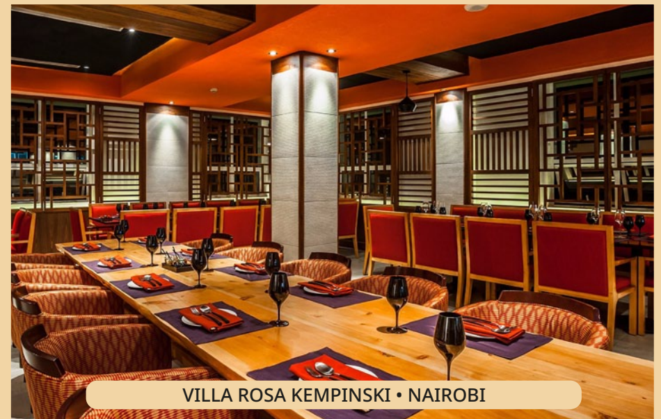
VILLA ROSA KEMPINSKI • NAIROBI