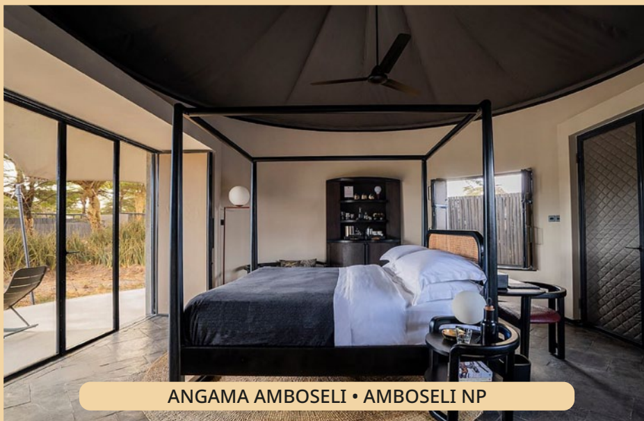
ANGAMA AMBOSELI • AMBOSELI NP