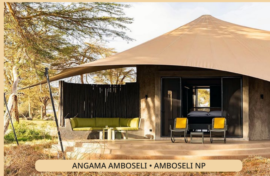
ANGAMA AMBOSELI • AMBOSELI NP