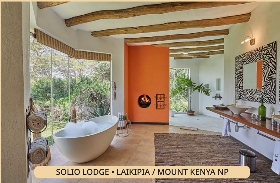
SOLIO LODGE • LAIKIPIA / MOUNT KENYA NP