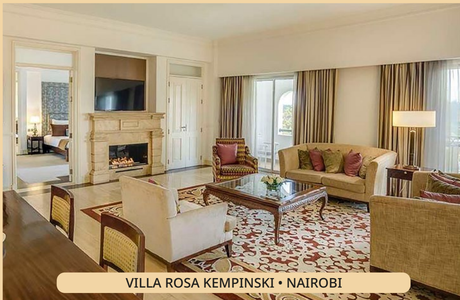
VILLA ROSA KEMPINSKI • NAIROBI