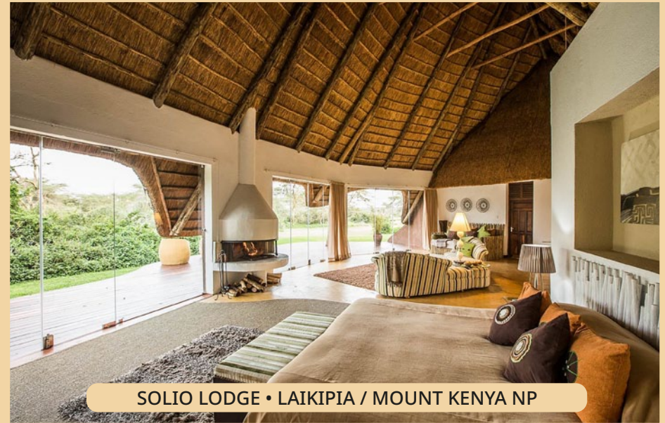
SOLIO LODGE • LAIKIPIA / MOUNT KENYA NP