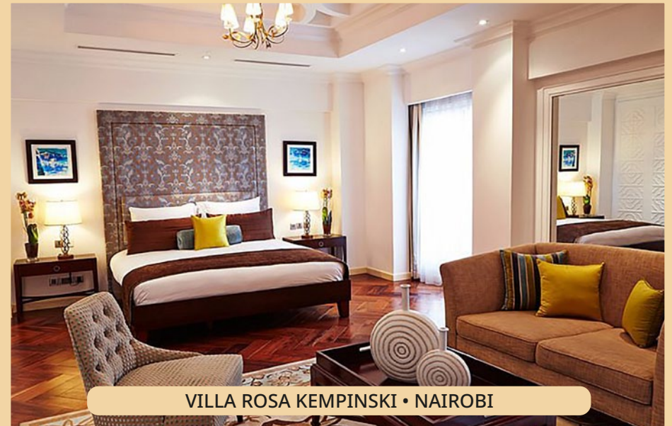
VILLA ROSA KEMPINSKI • NAIROBI