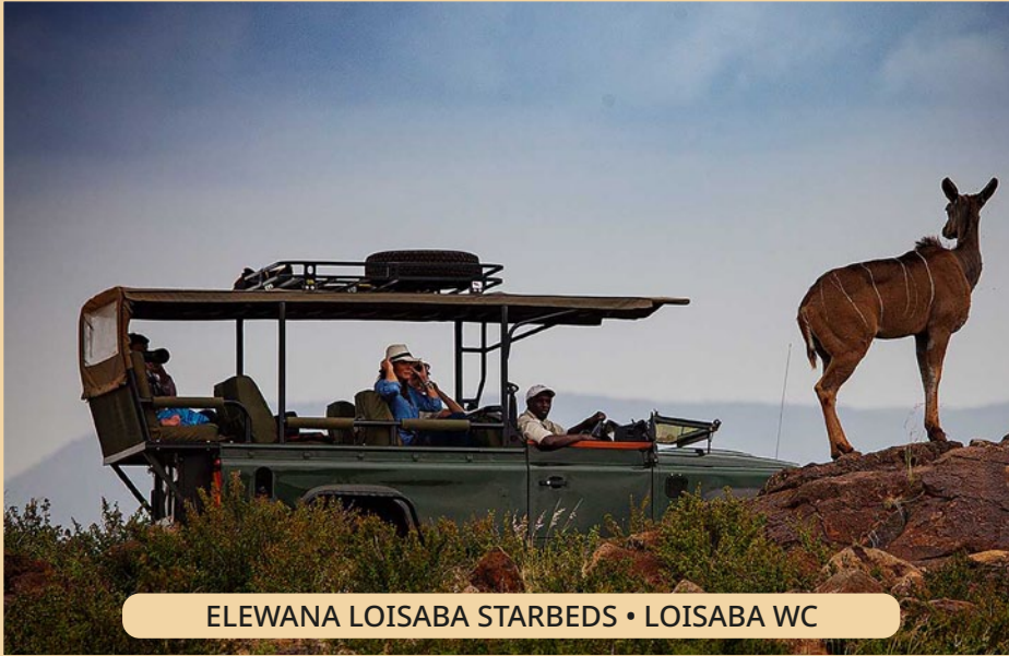
ELEWANA LOISABA STARBEDS • LOISABA WC