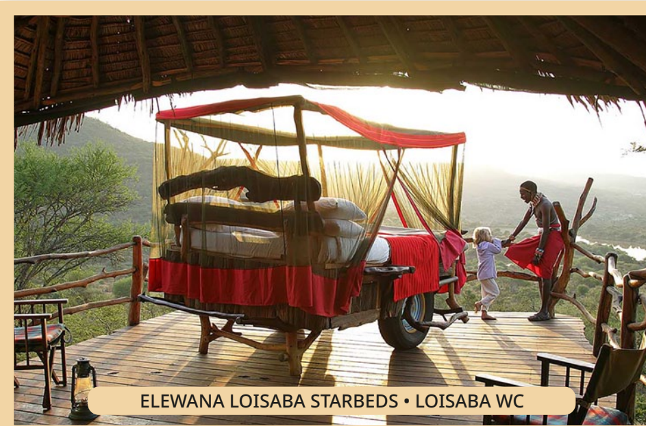
ELEWANA LOISABA STARBEDS • LOISABA WC