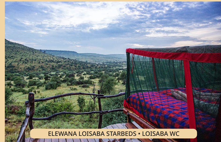
ELEWANA LOISABA STARBEDS • LOISABA WC