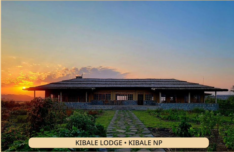
KIBALE LODGE • KIBALE NP