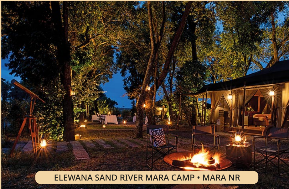
ELEWANA SAND RIVER MARA CAMP • MARA NR