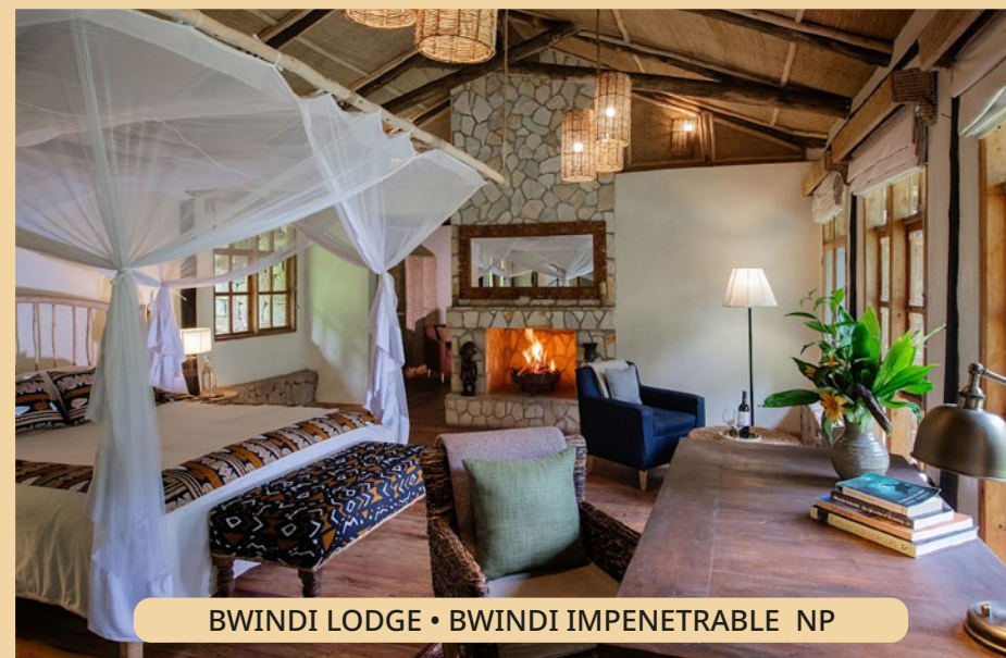
BWINDI LODGE • BWINDI IMPENETRABLE NP