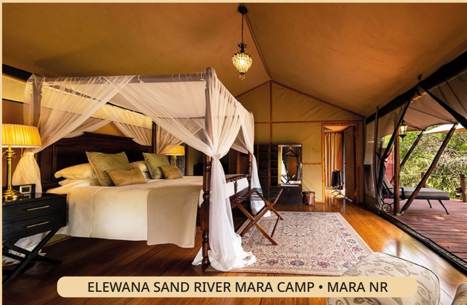
ELEWANA SAND RIVER MARA CAMP • MARA NR