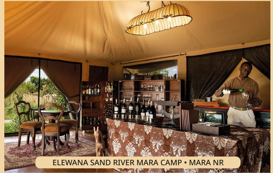
ELEWANA SAND RIVER MARA CAMP • MARA NR