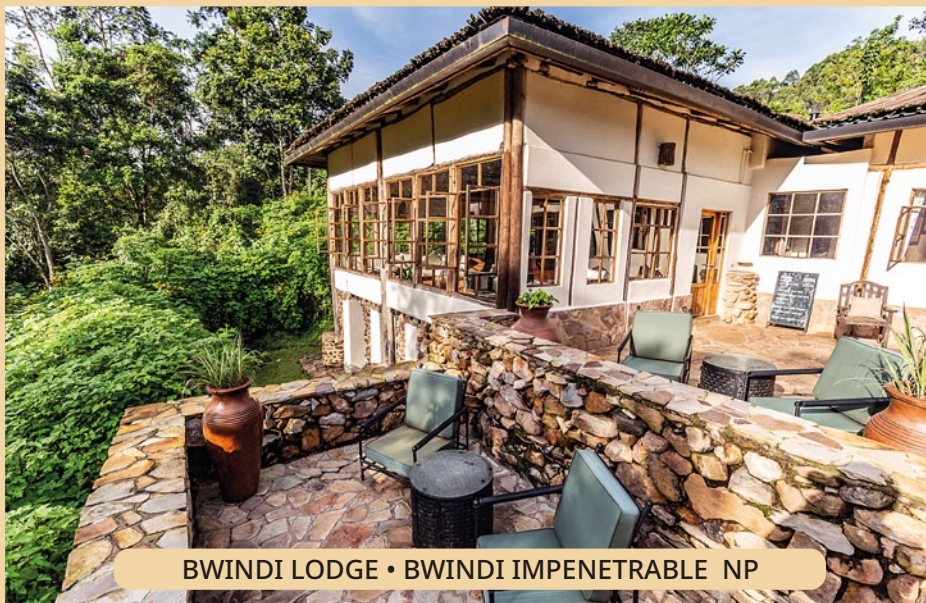
BWINDI LODGE • BWINDI IMPENETRABLE NP