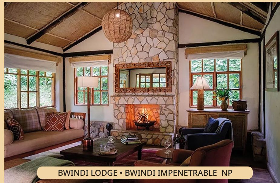
BWINDI LODGE • BWINDI IMPENETRABLE NP