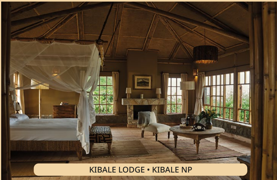
KIBALE LODGE • KIBALE NP