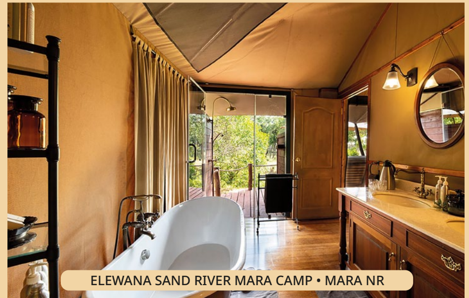
ELEWANA SAND RIVER MARA CAMP • MARA NR