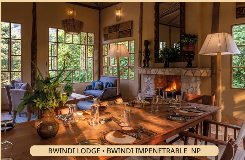
BWINDI LODGE • BWINDI IMPENETRABLE NP