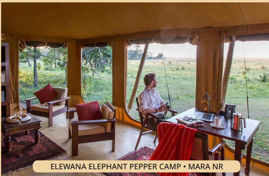
ELEWANA ELEPHANT PEPPER CAMP • MARA NR