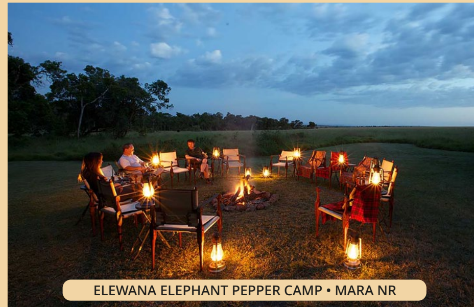
ELEWANA ELEPHANT PEPPER CAMP • MARA NR