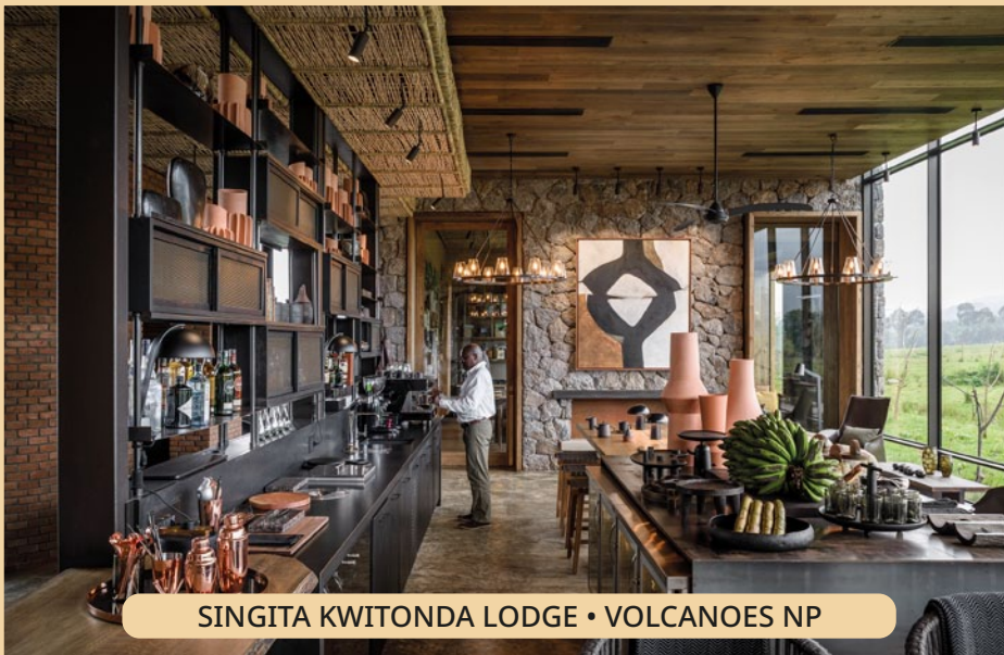
SINGITA KWITONDA LODGE • VOLCANOES NP