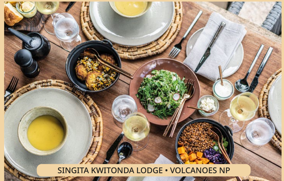
SINGITA KWITONDA LODGE • VOLCANOES NP