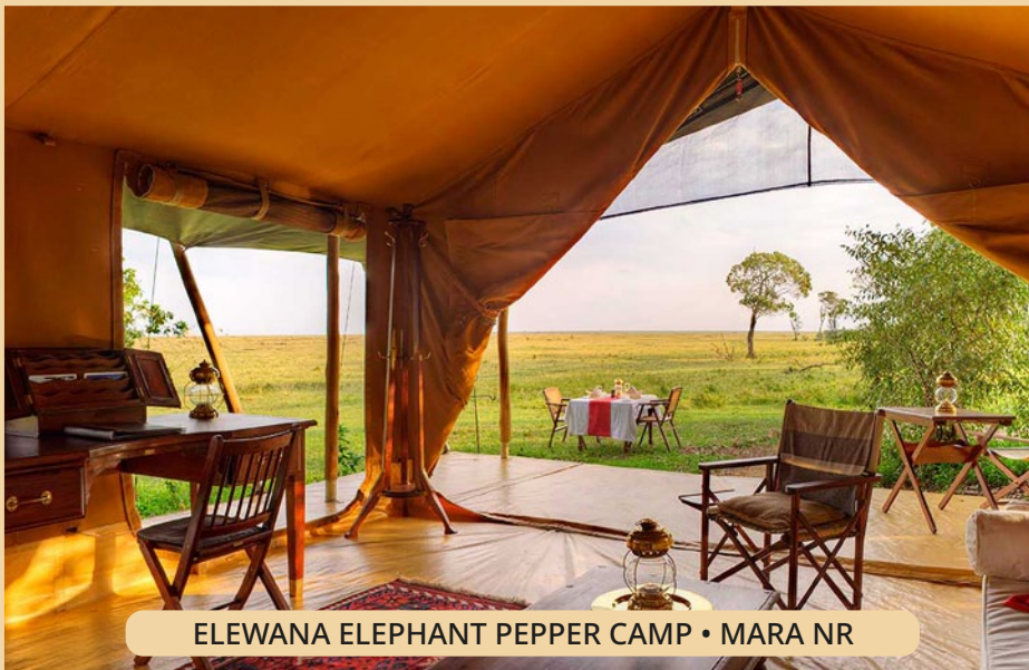
ELEWANA ELEPHANT PEPPER CAMP • MARA NR