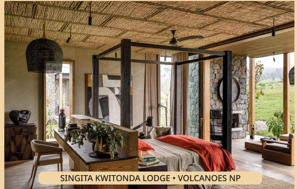
SINGITA KWITONDA LODGE • VOLCANOES NP