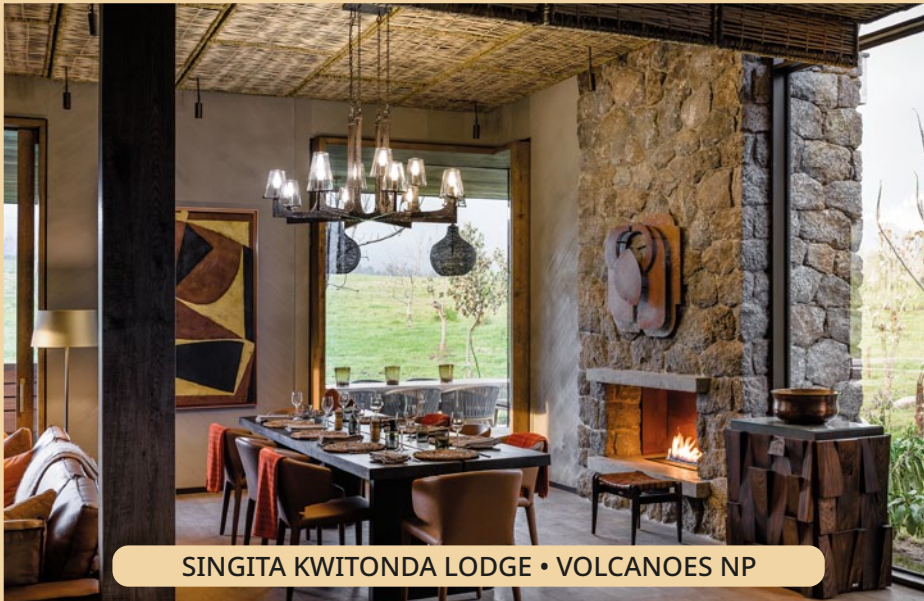
SINGITA KWITONDA LODGE • VOLCANOES NP