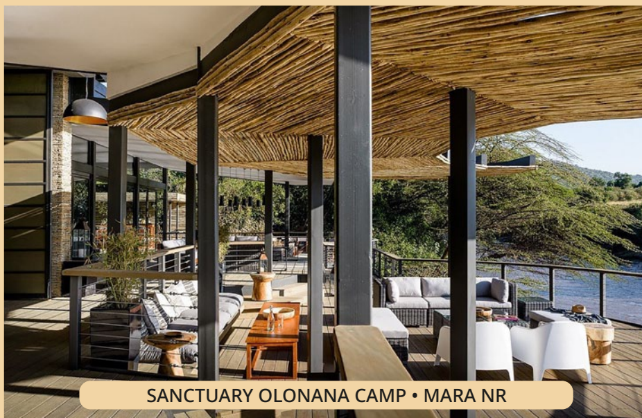
SANCTUARY OLONANA CAMP • MARA NR