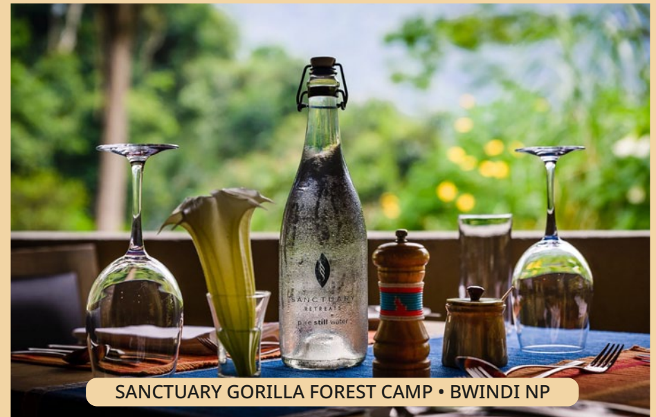
SANCTUARY GORILLA FOREST CAMP • BWINDI NP