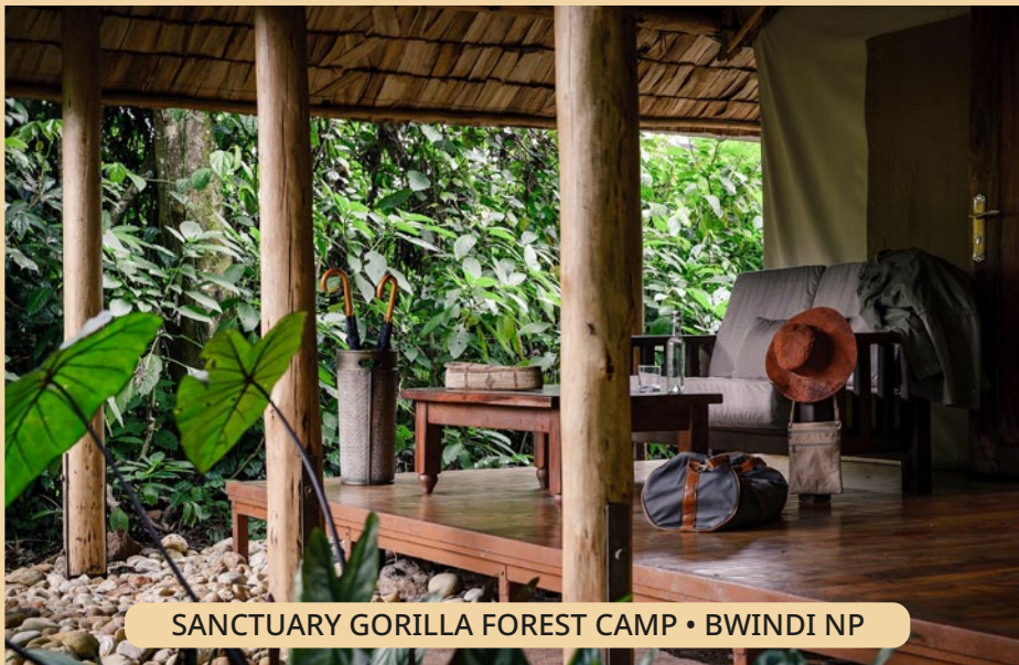
SANCTUARY GORILLA FOREST CAMP • BWINDI NP