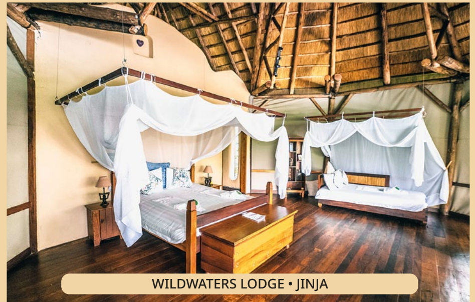
WILDWATERS LODGE • JINJA