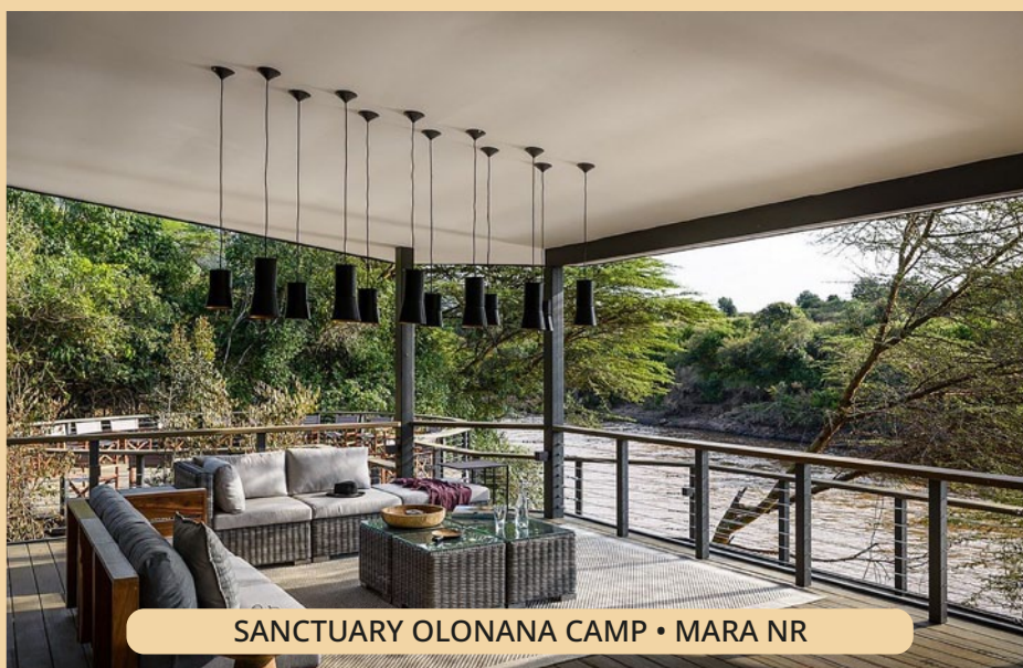
SANCTUARY OLONANA CAMP • MARA NR