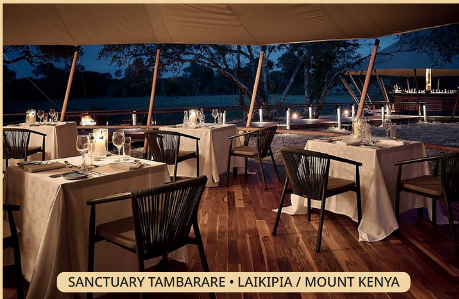
SANCTUARY TAMBARARE • LAIKIPIA / MOUNT KENYA