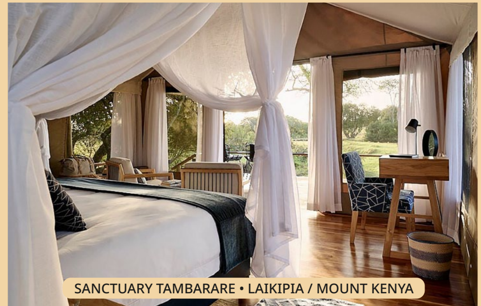
SANCTUARY TAMBARARE • LAIKIPIA / MOUNT KENYA