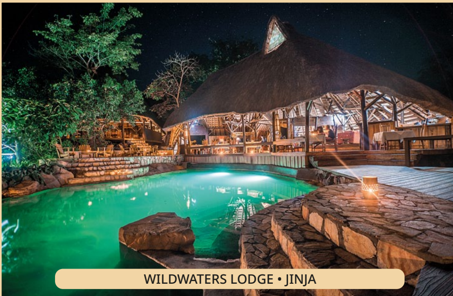
WILDWATERS LODGE • JINJA