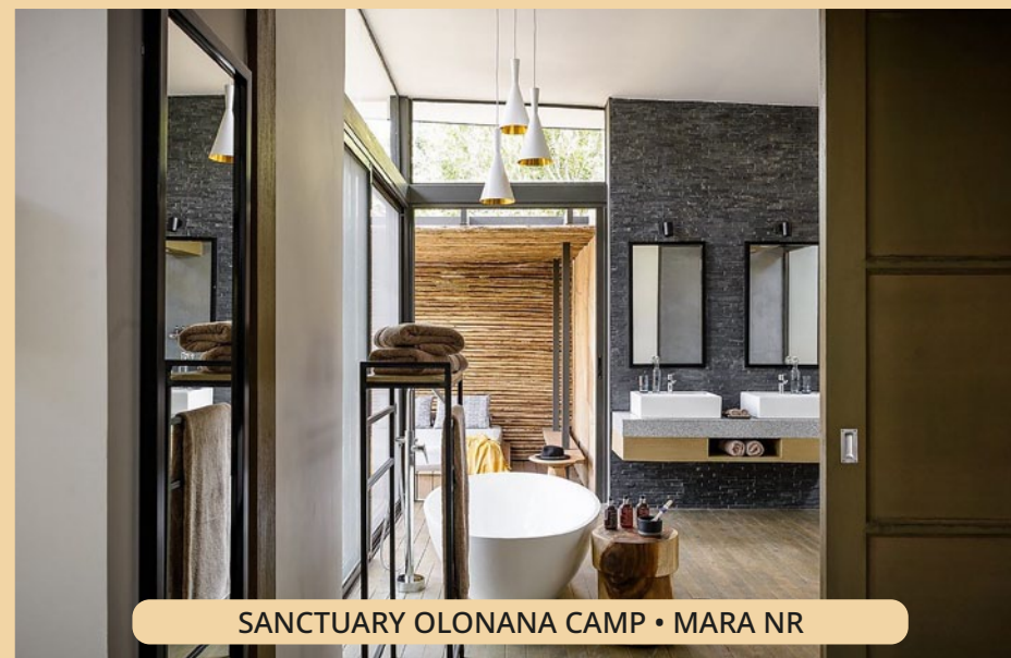
SANCTUARY OLONANA CAMP • MARA NR