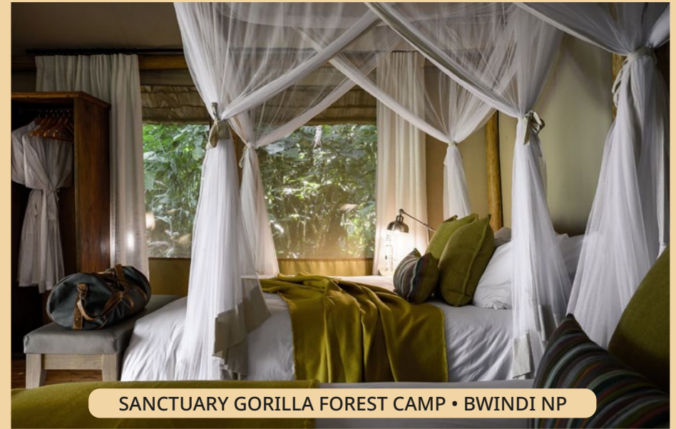
SANCTUARY GORILLA FOREST CAMP • BWINDI NP