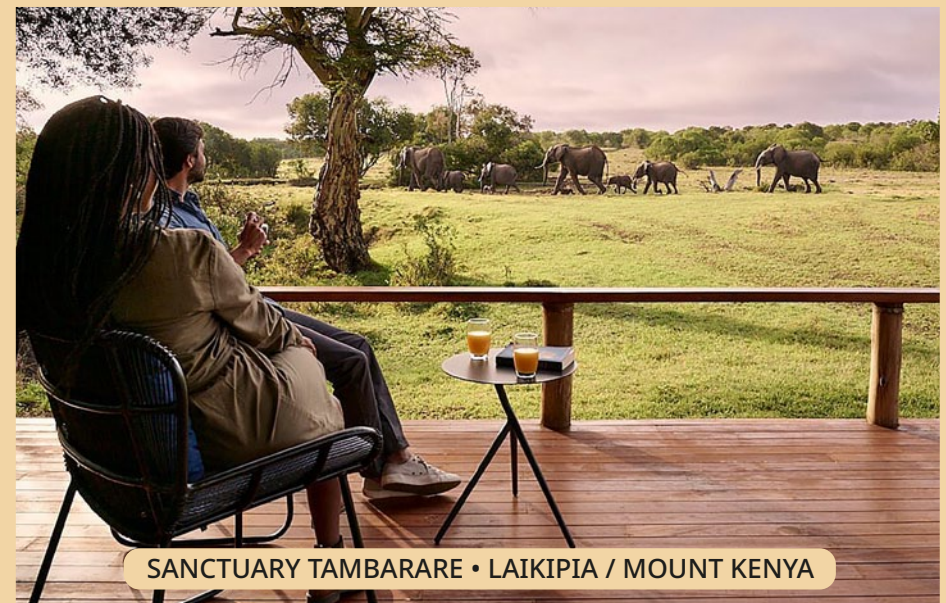
SANCTUARY TAMBARARE • LAIKIPIA / MOUNT KENYA