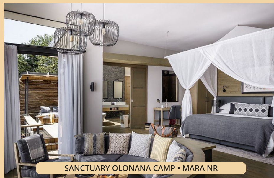
SANCTUARY OLONANA CAMP • MARA NR