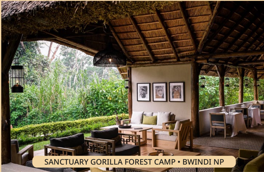
SANCTUARY GORILLA FOREST CAMP • BWINDI NP