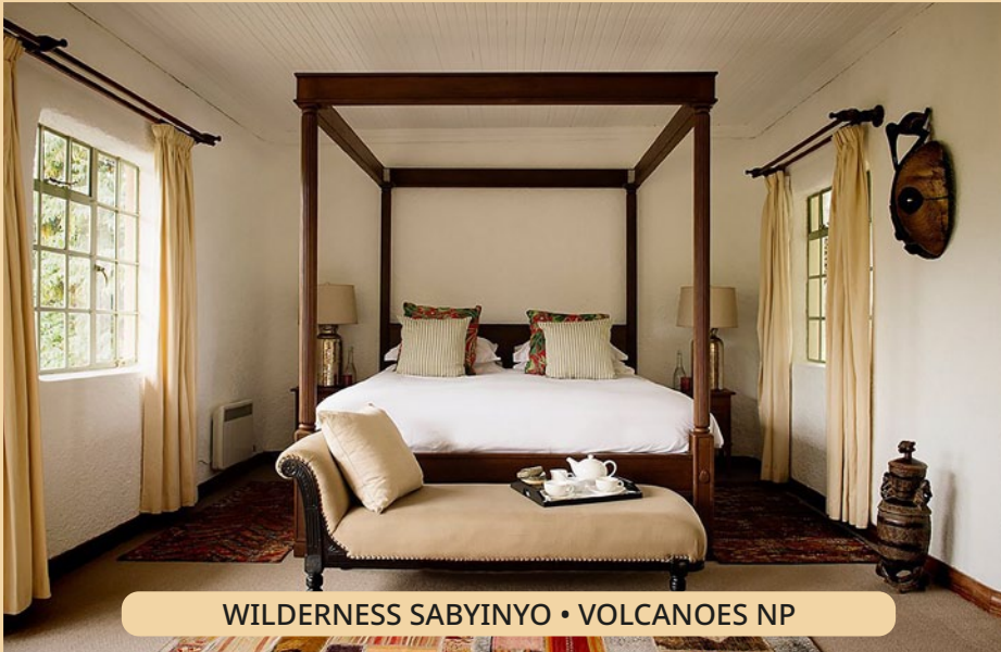
WILDERNESS SABYINYO • VOLCANOES NP