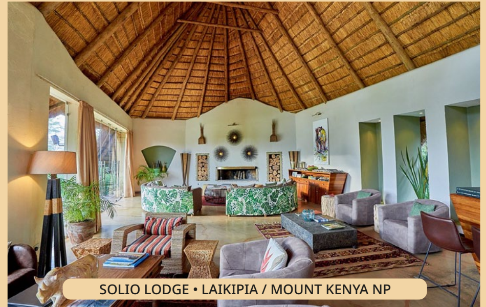
SOLIO LODGE • LAIKIPIA / MOUNT KENYA NP