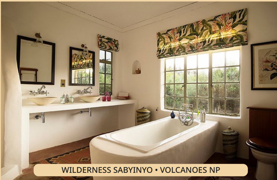
WILDERNESS SABYINYO • VOLCANOES NP