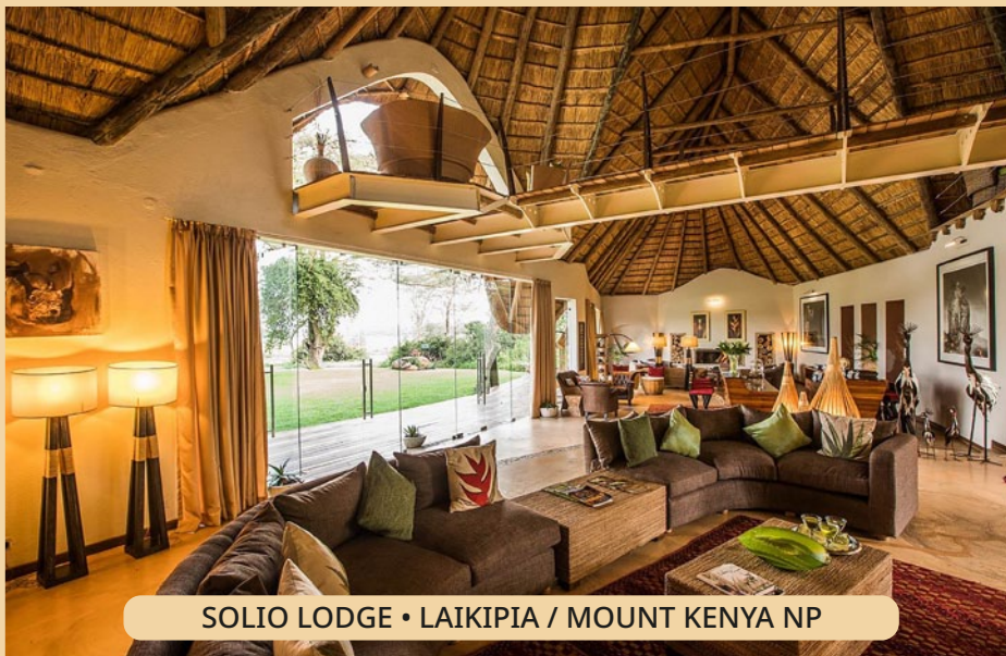
SOLIO LODGE • LAIKIPIA / MOUNT KENYA NP