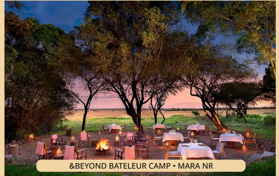
&BEYOND BATELEUR CAMP • MARA NR