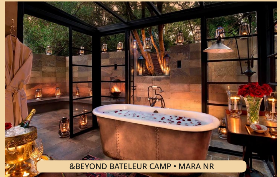
&BEYOND BATELEUR CAMP • MARA NR