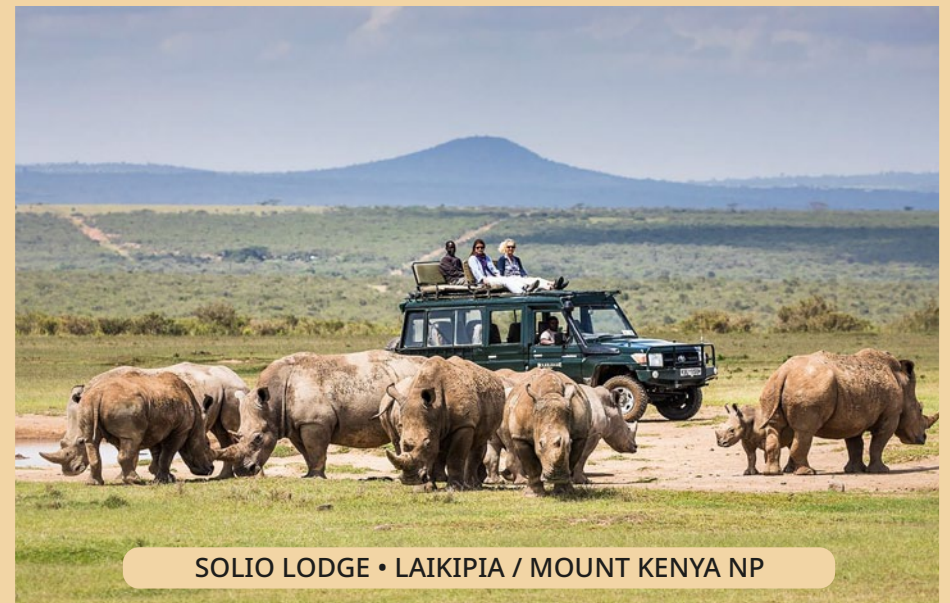
SOLIO LODGE • LAIKIPIA / MOUNT KENYA NP