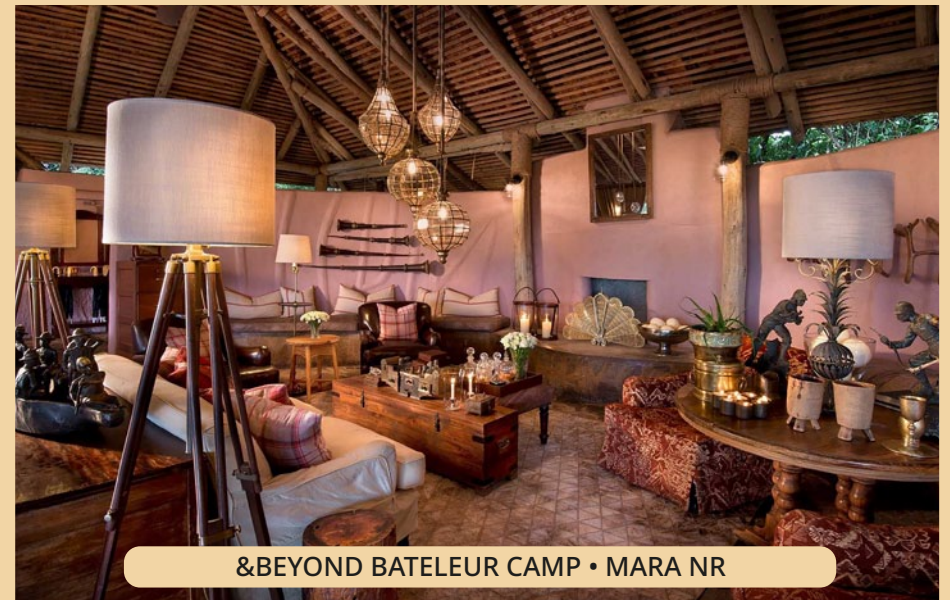
&BEYOND BATELEUR CAMP • MARA NR