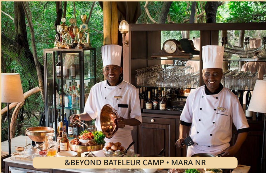
&BEYOND BATELEUR CAMP • MARA NR