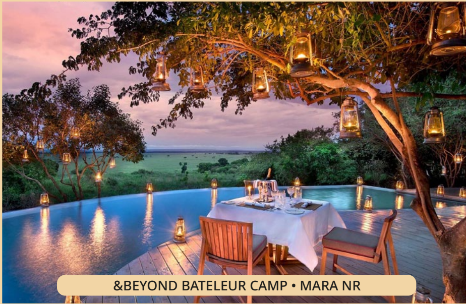
&BEYOND BATELEUR CAMP • MARA NR