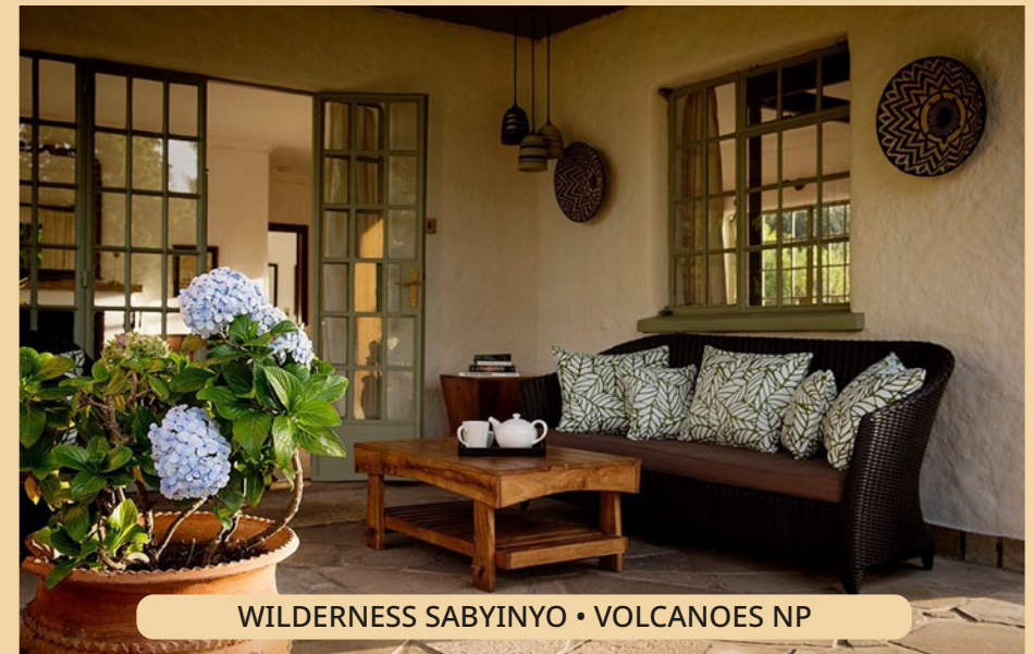
WILDERNESS SABYINYO • VOLCANOES NP