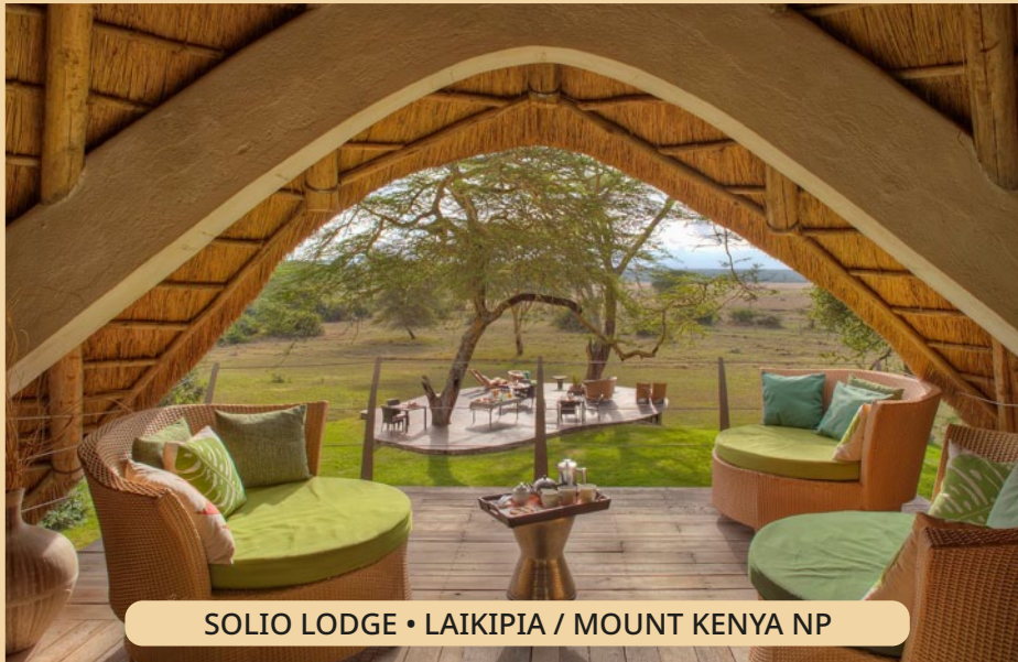
SOLIO LODGE • LAIKIPIA / MOUNT KENYA NP