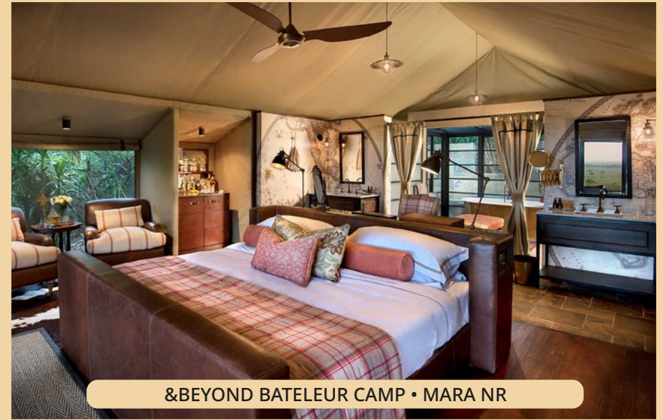
&BEYOND BATELEUR CAMP • MARA NR